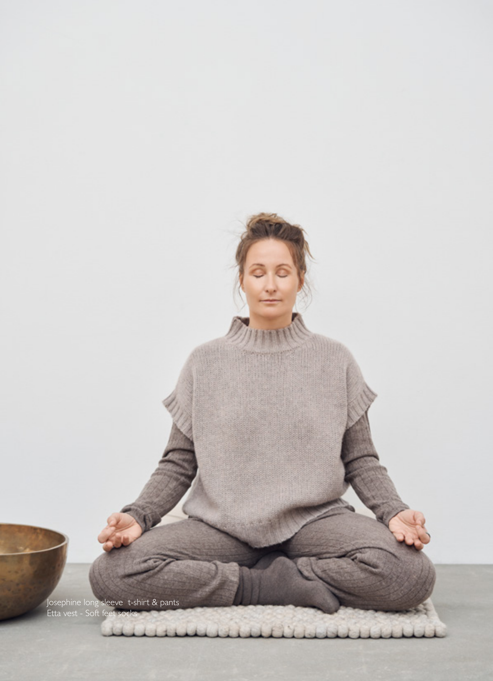
Josephine long sleeve t-shirt & pants Etta vest - Soft feet socks