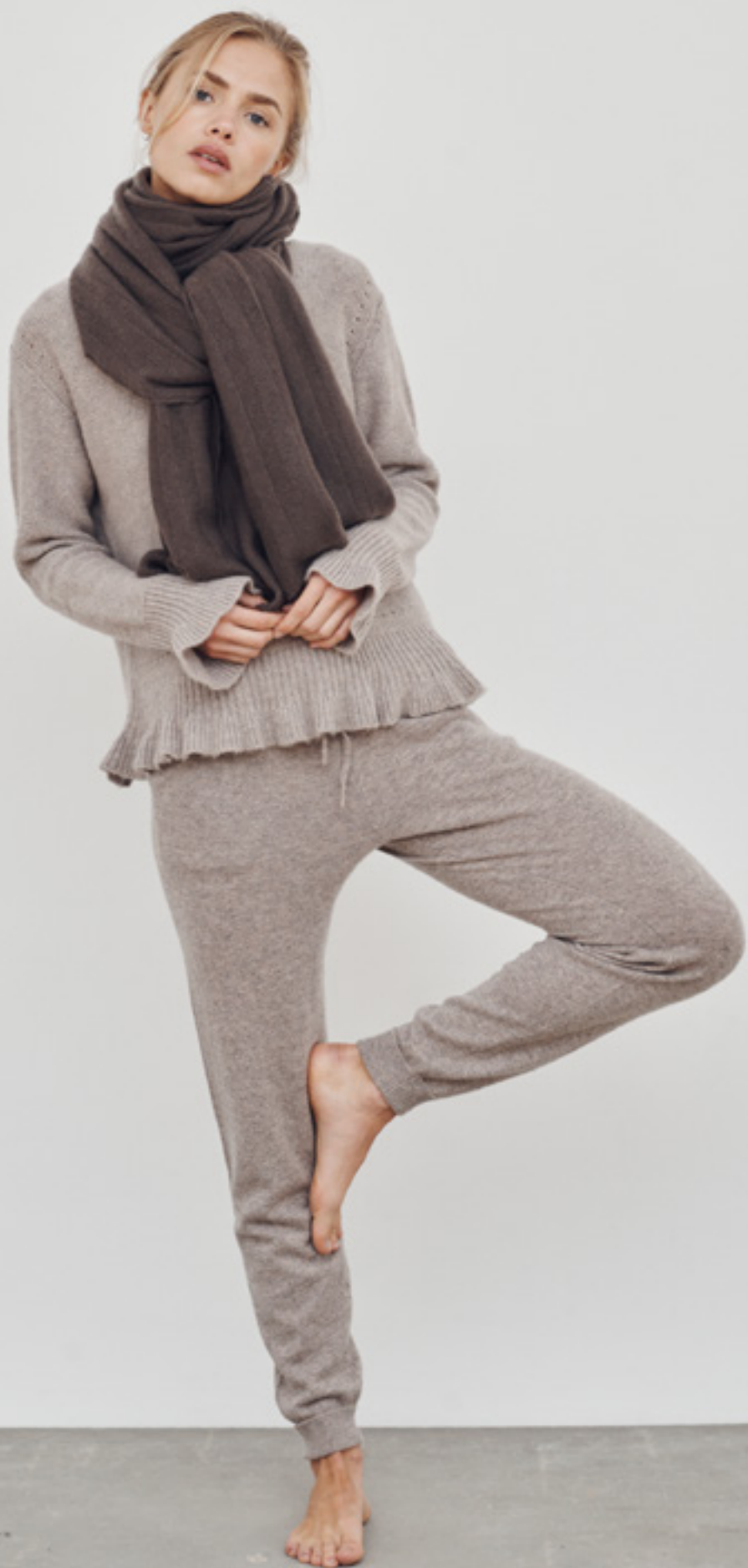
Hannah scarf Ea sweater Cinzia pants