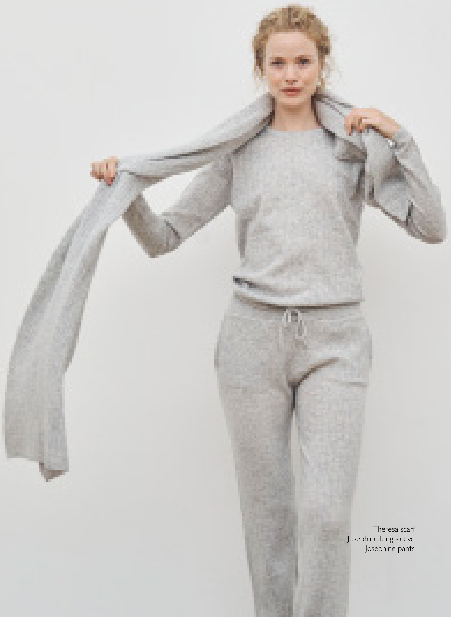
Theresa scarf Josephine long sleeve Josephine pants