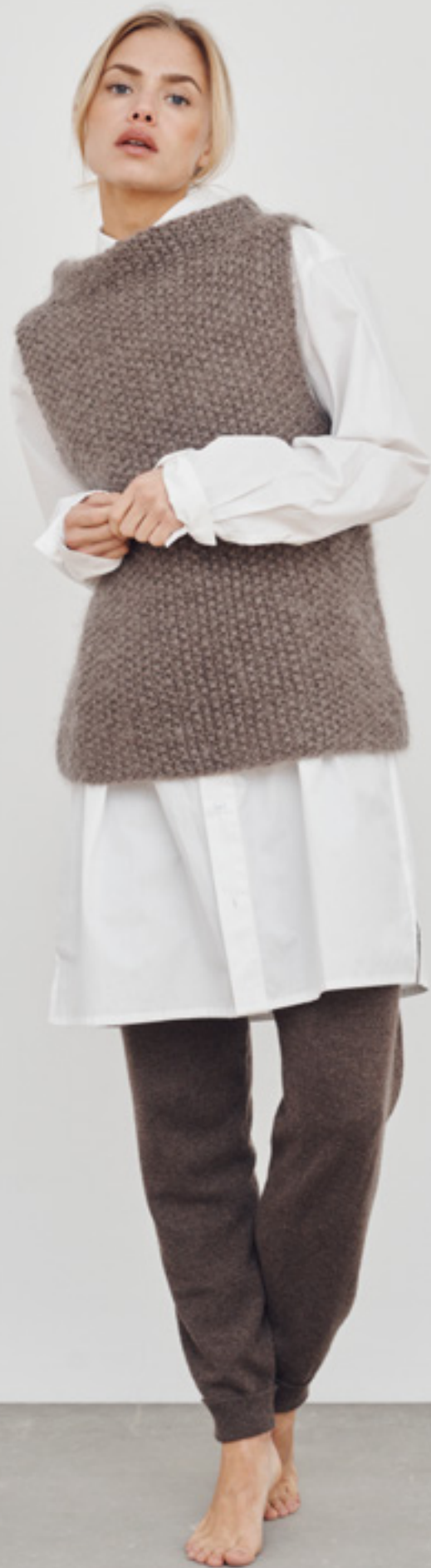
Hope vest Lina long shirt Cornelia pants