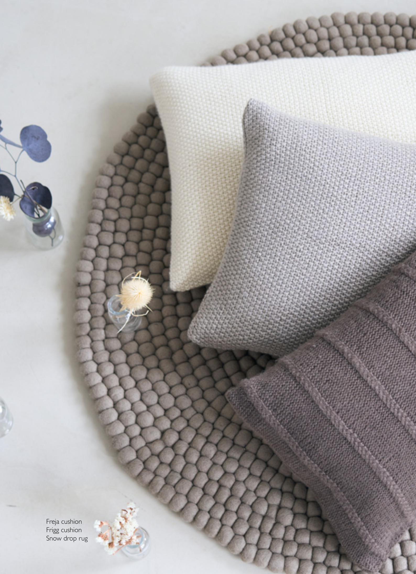
Freja cushion Frigg cushion Snow drop rug