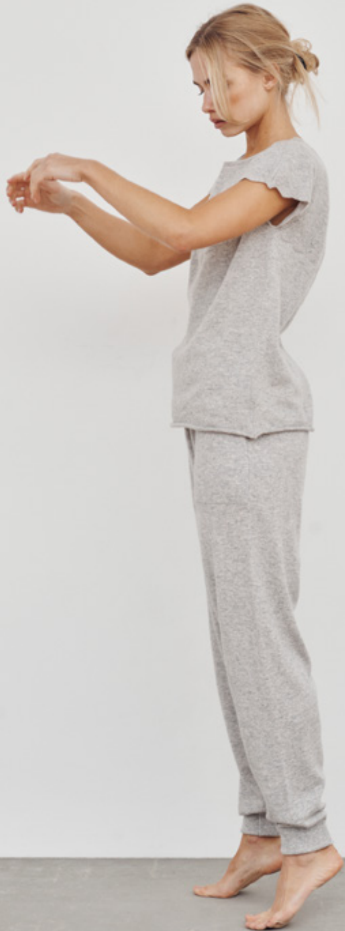
Beatrice blouse Cinzia pants