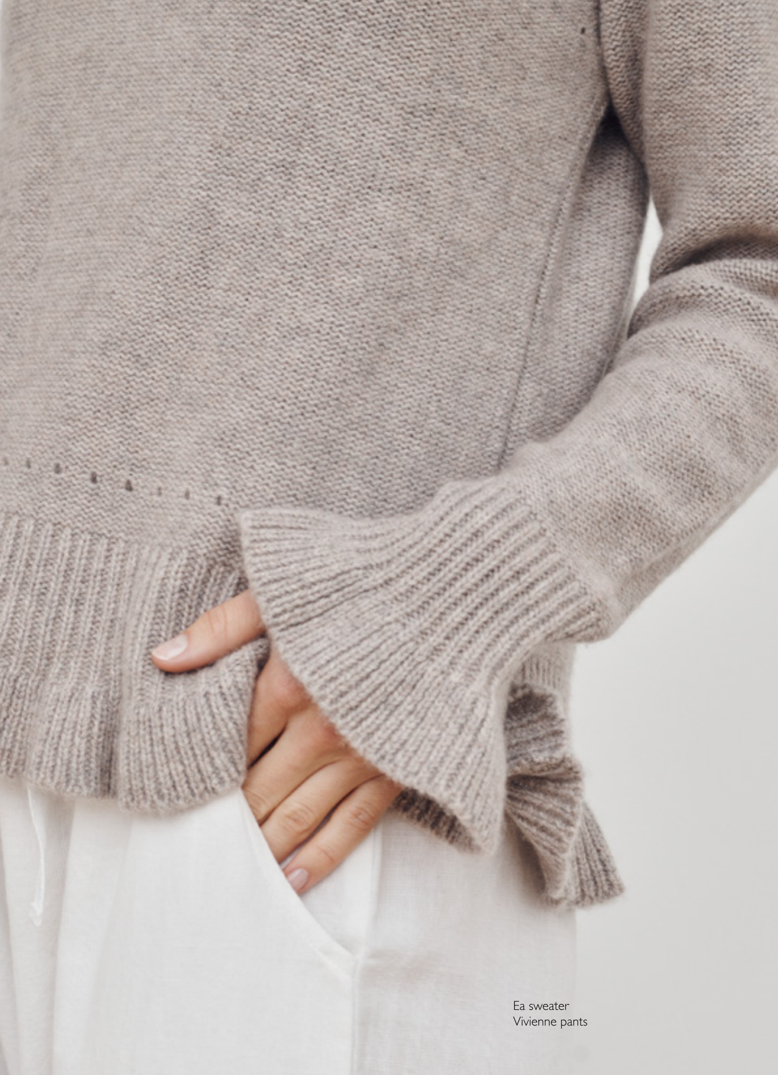
Ea sweater Vivienne pants