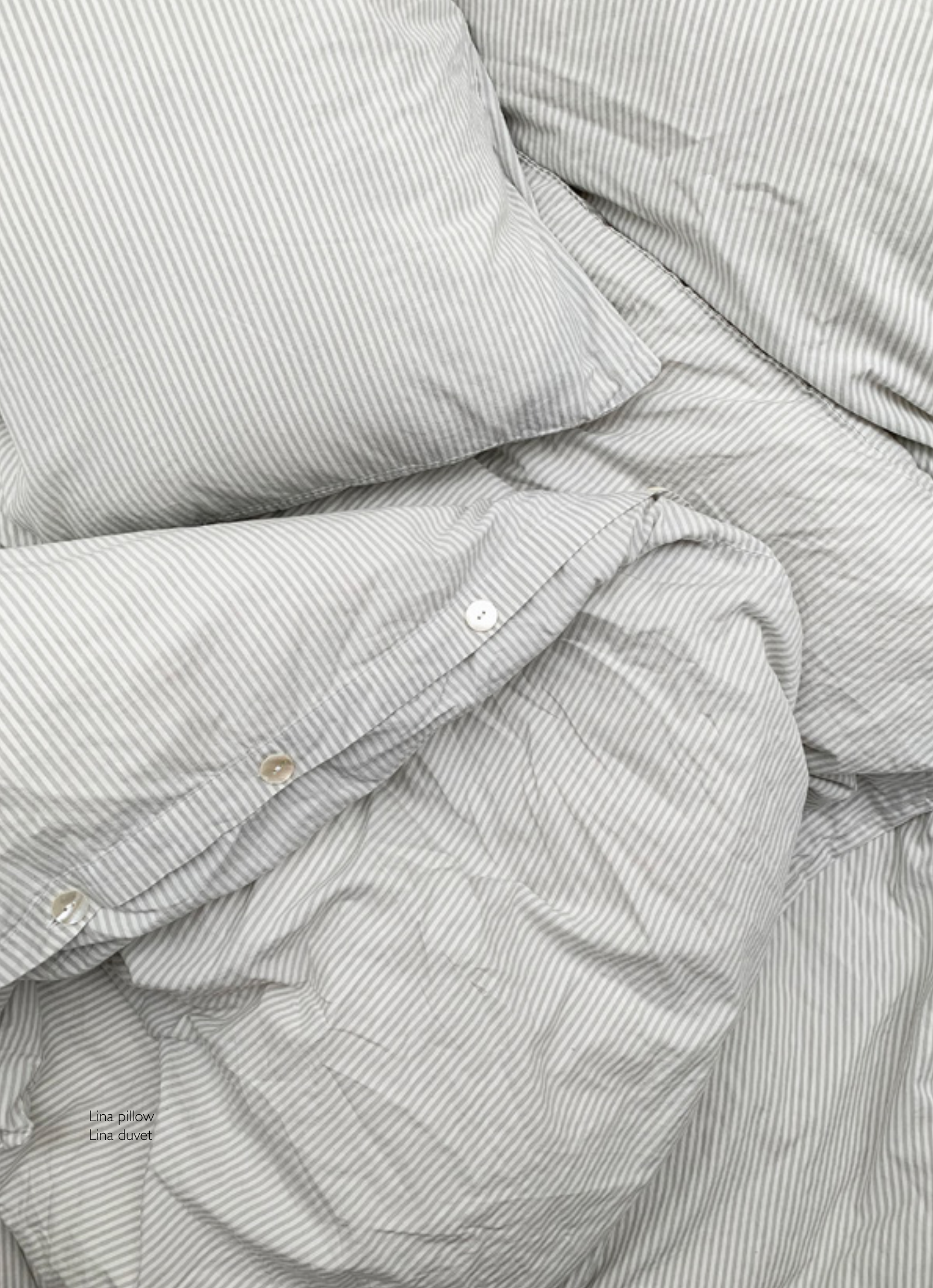
Lina pillow Lina duvet