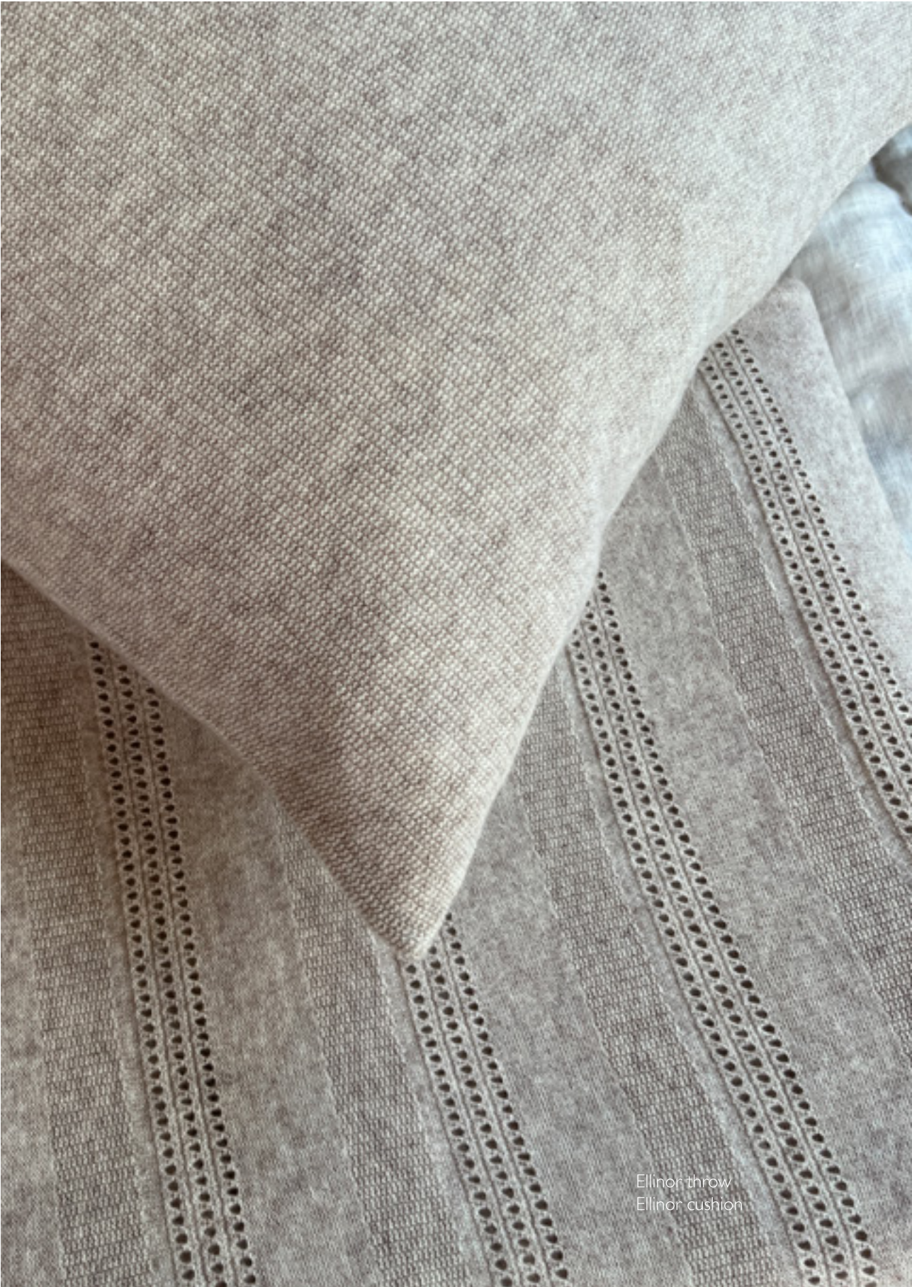
Ellinor throw Ellinor cushion