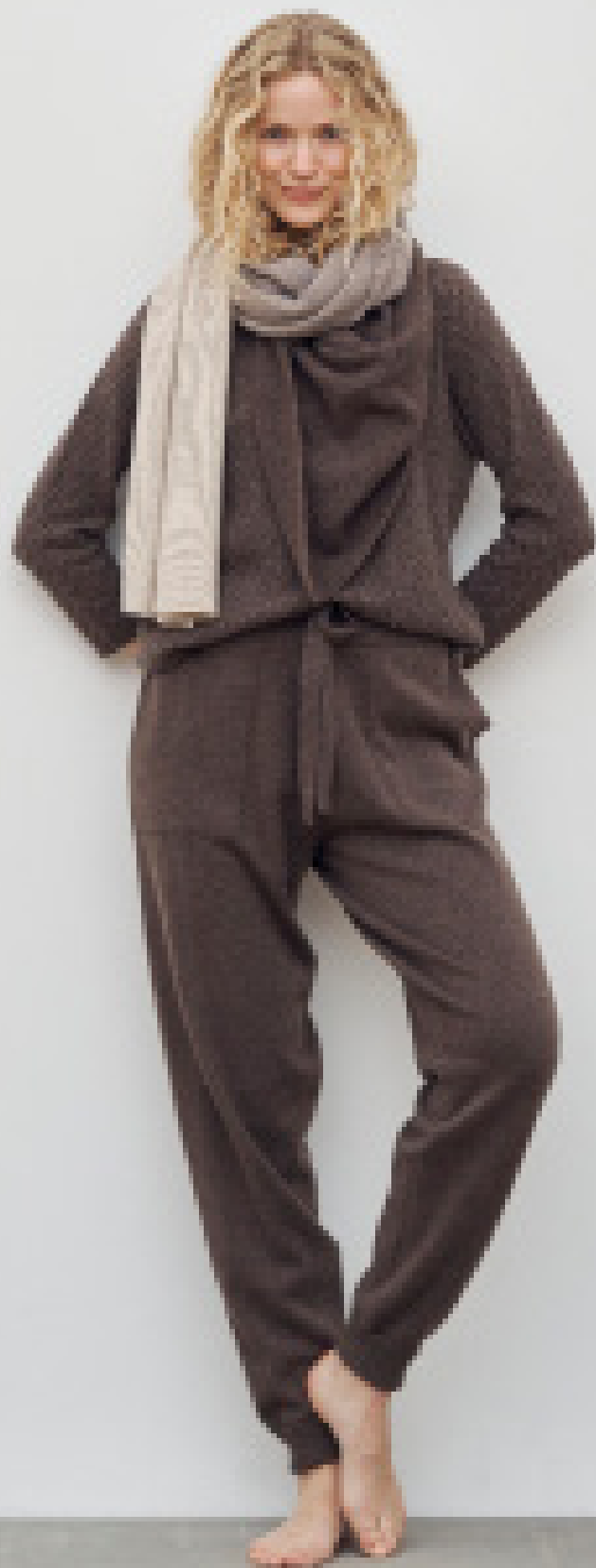
Anabella scarf Chuck blouse Cornelia pants