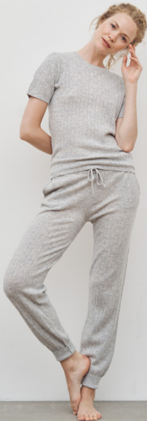
Josephine t-shirt Josephine pants