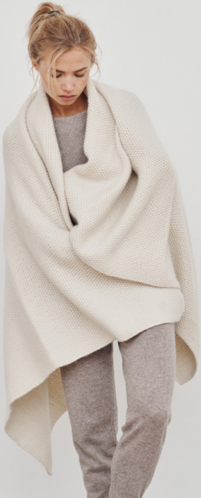
Freja throw Ea sweater Cinzia pants