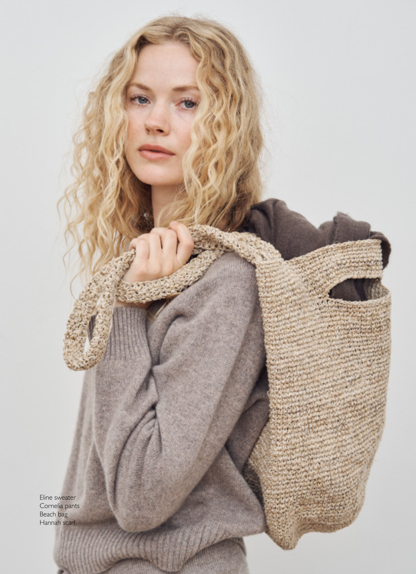
Eline sweater Cornelia pants Beach bag Hannah scarf