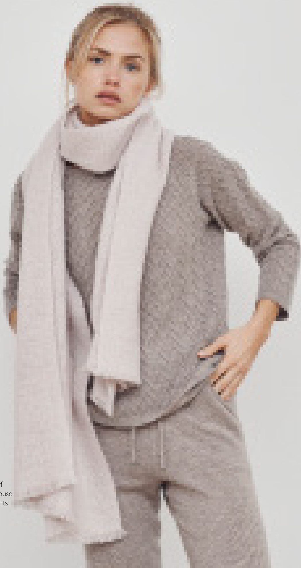
Spun scarf Chuck blouse Cinzia pants