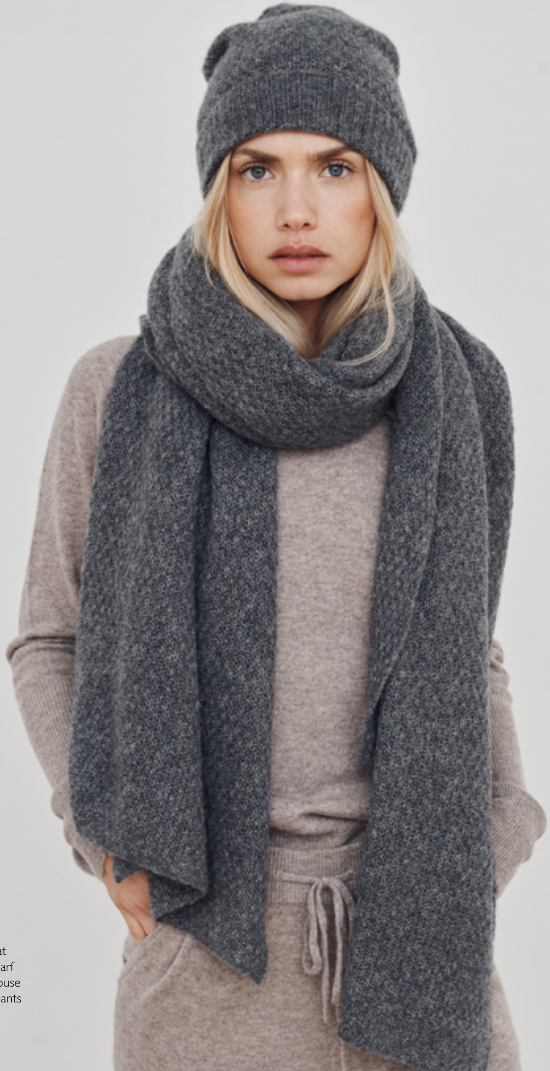
Anna hat Anna scarf Faith blouse Cinzia pants