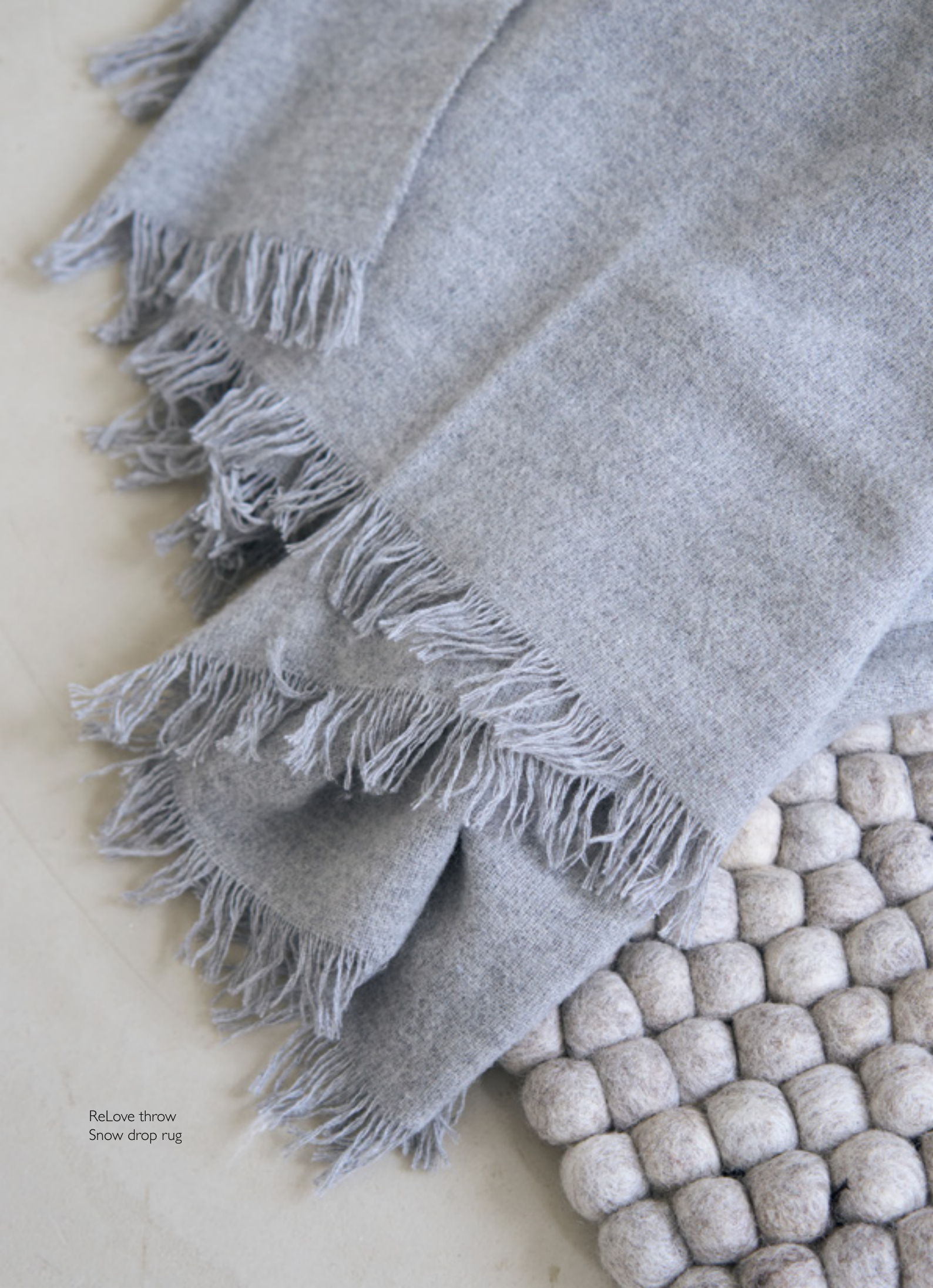
ReLove throw Snow drop rug