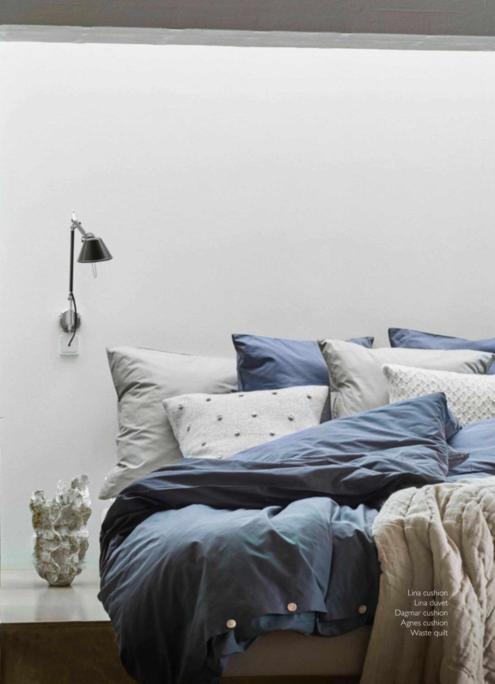
Lina cushion Lina duvet Dagmar cushion Agnes cushion Waste quilt