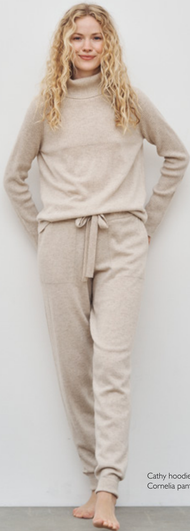
Cathy hoodie Cornelia pants