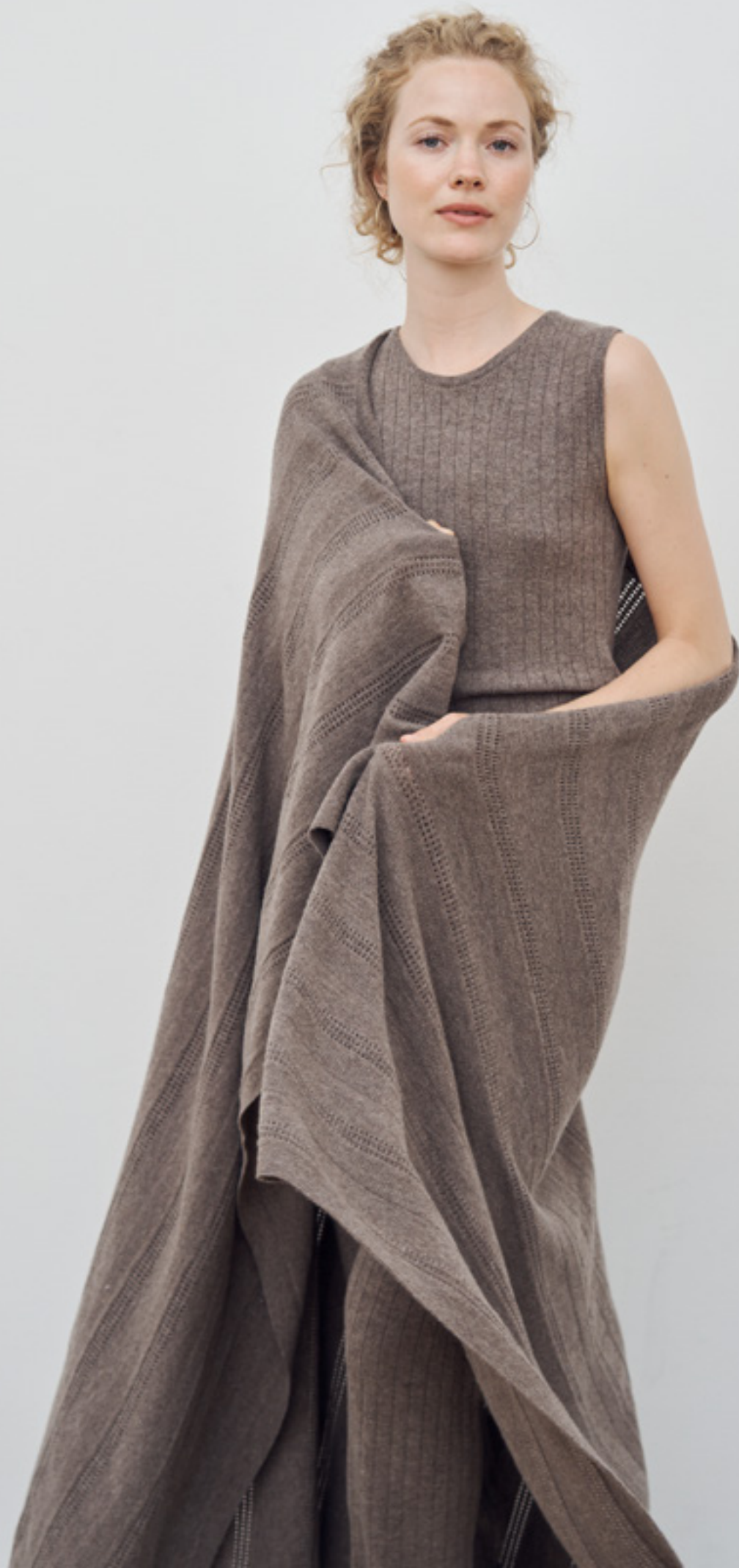
Josephine tank top Ellinor throw Josephine pants