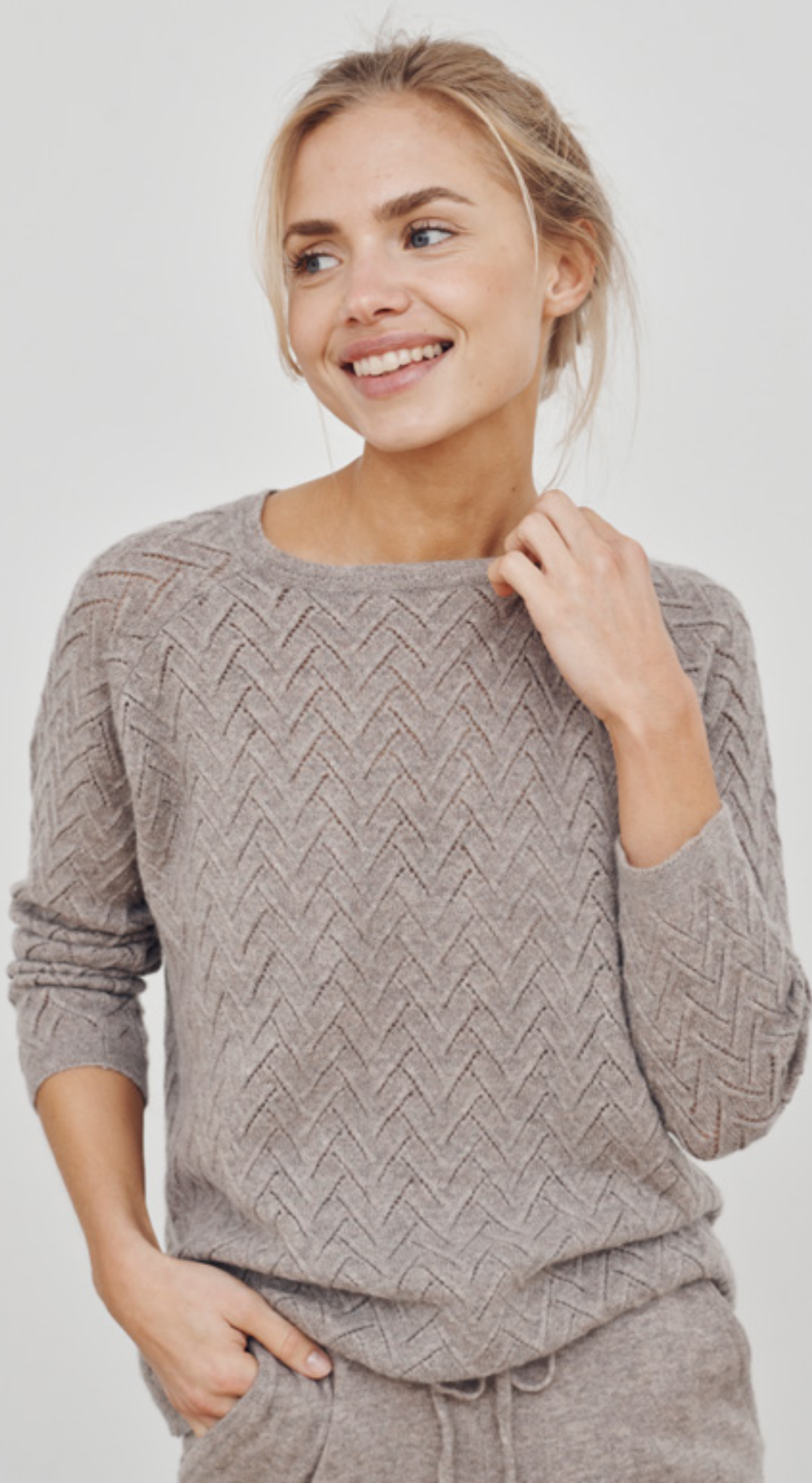
Chuck blouse Cinzia pants