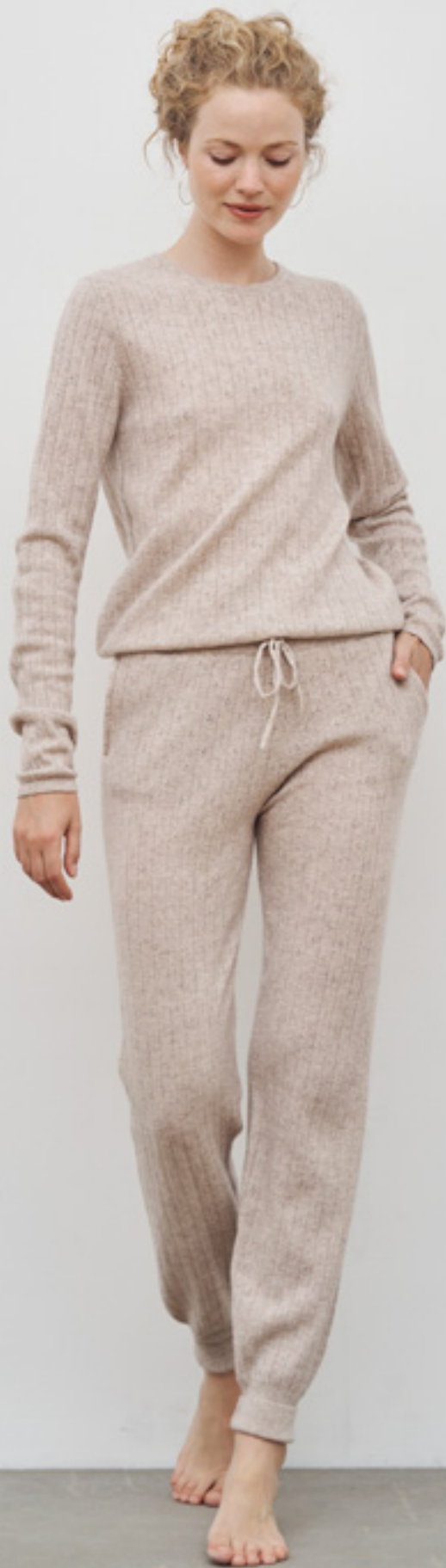
Josephine long sleeve t-shirt Josephine pants