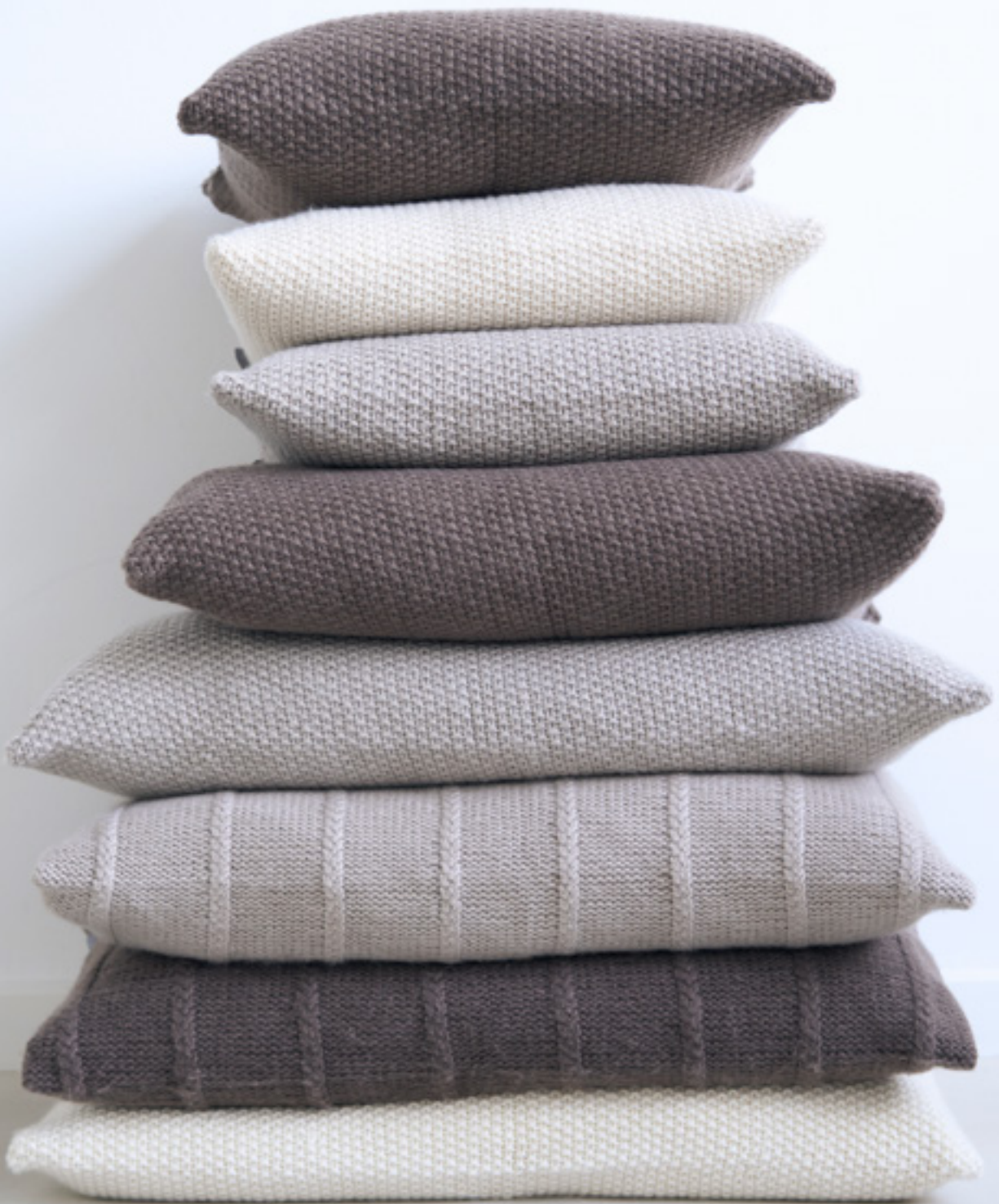
Freja & Frigg cushions