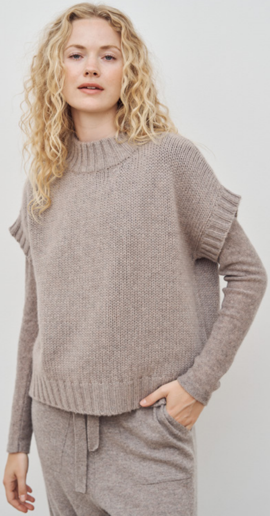
Etta vest Victoria blouse Cornelia pants