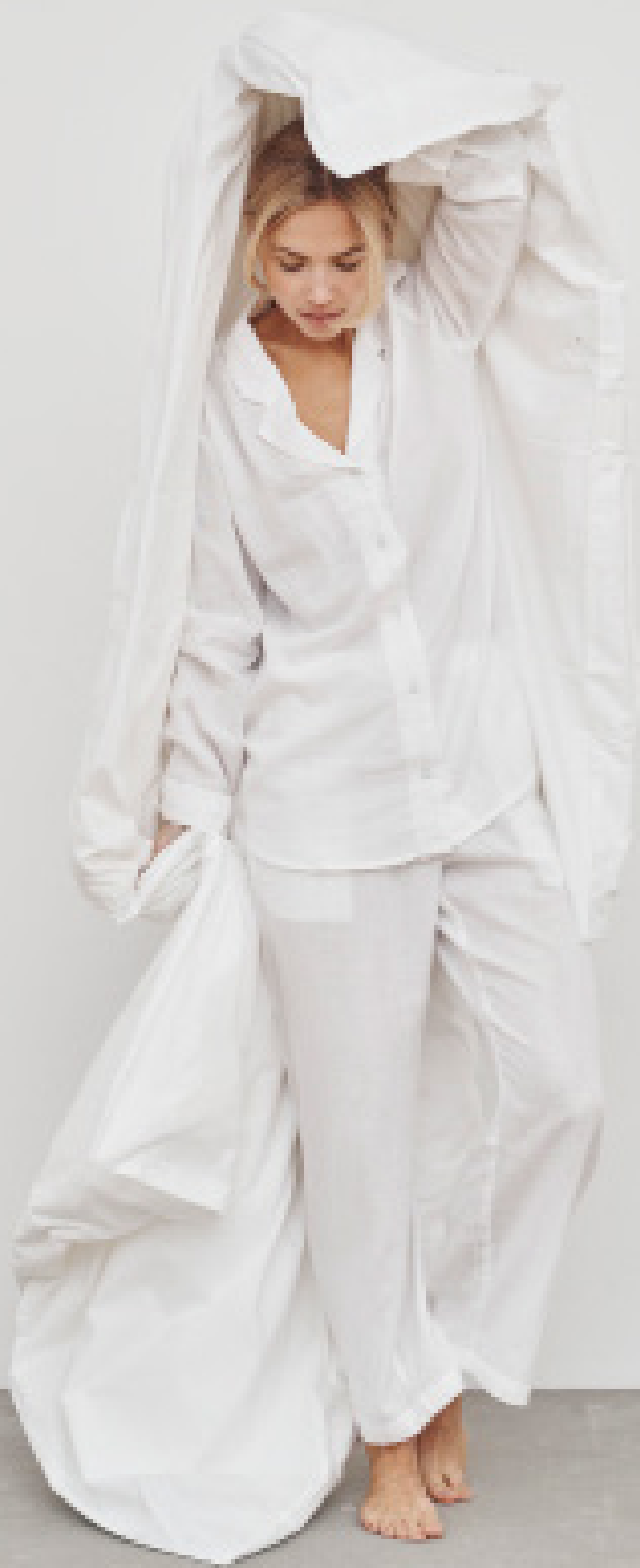
Vivienne shirt Vivienne pants Veronica duvet