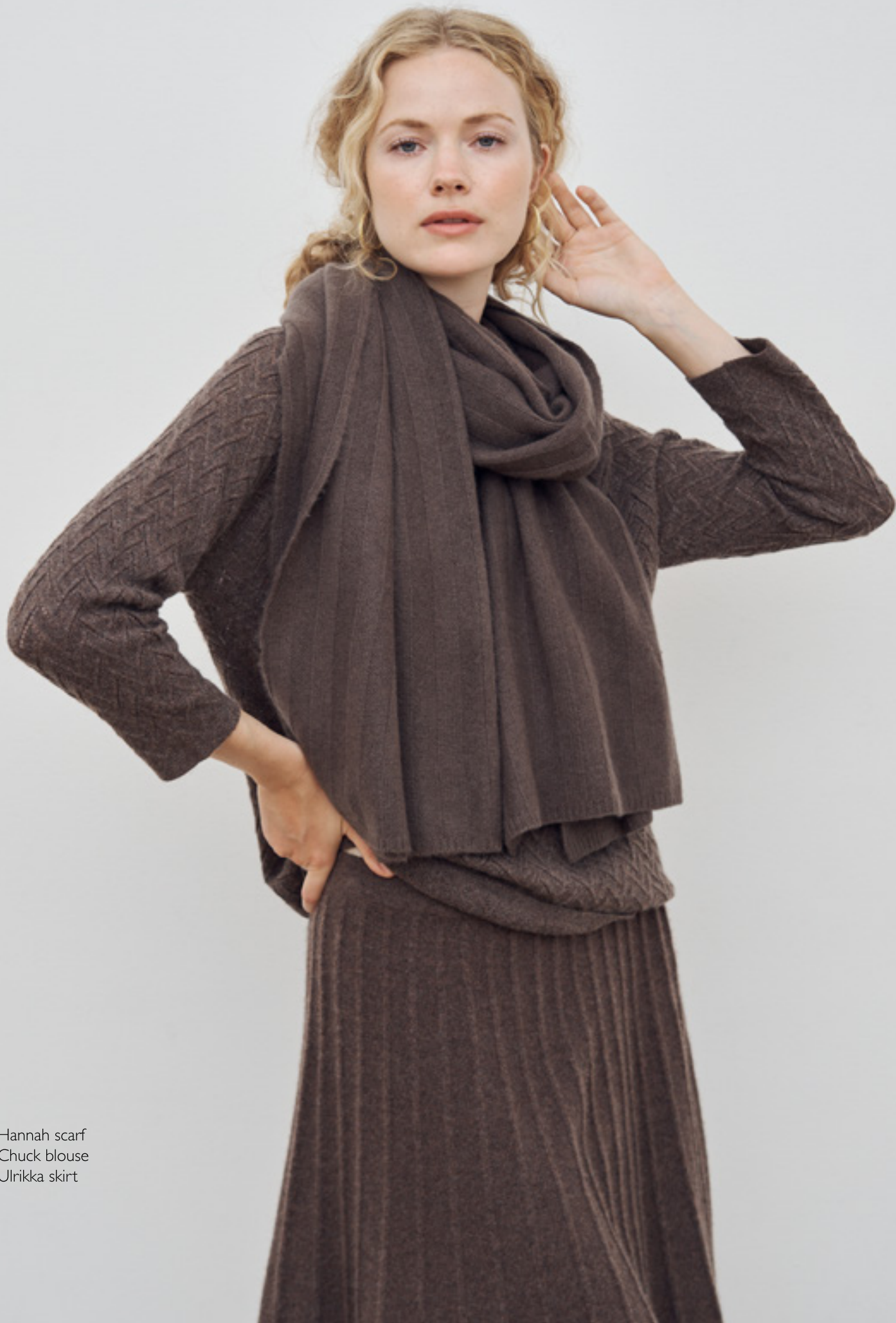
Hannah scarf Chuck blouse Ulrikka skirt