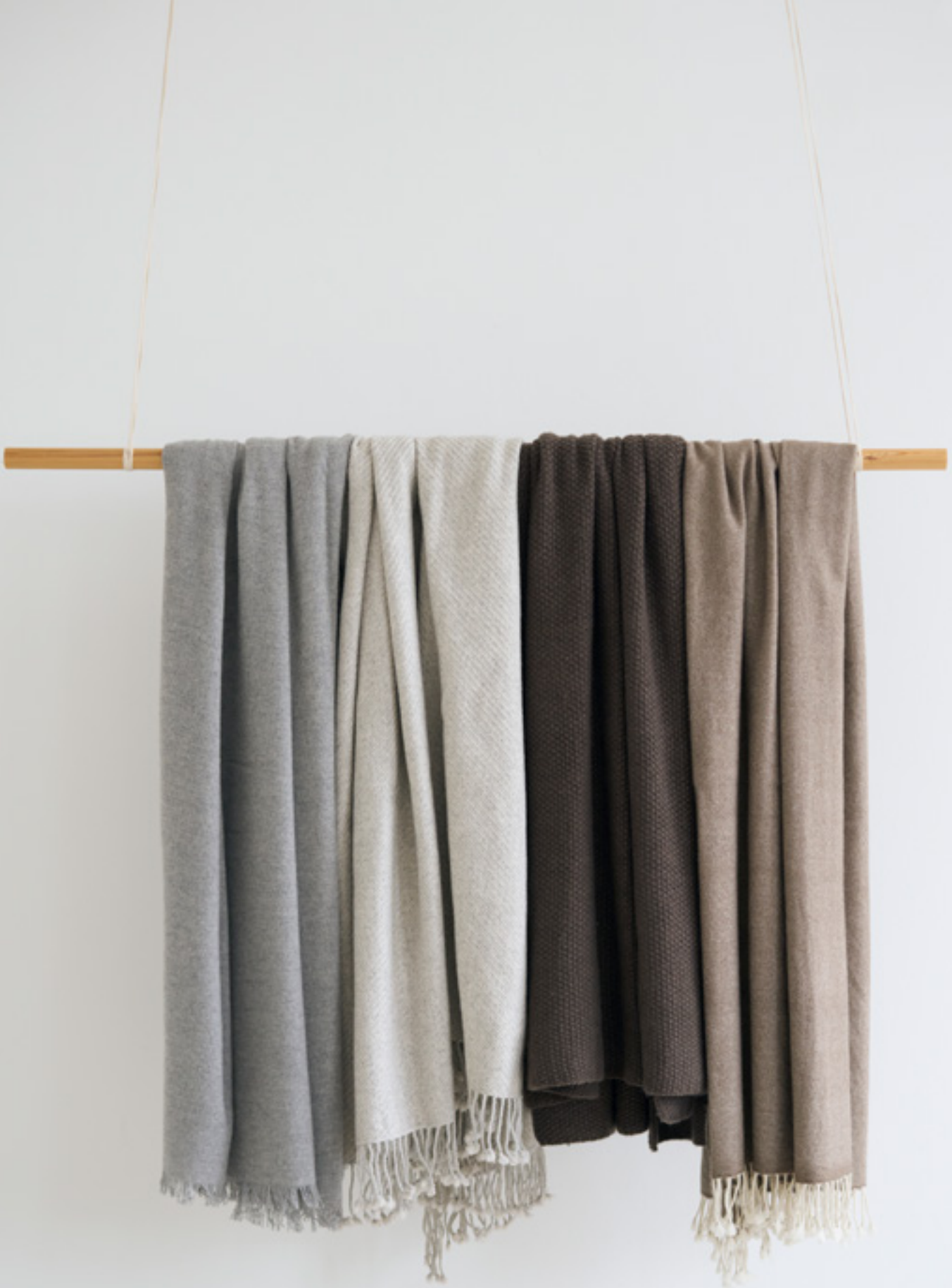
ReLove throw Susan throw Freja throw Herringbone throw