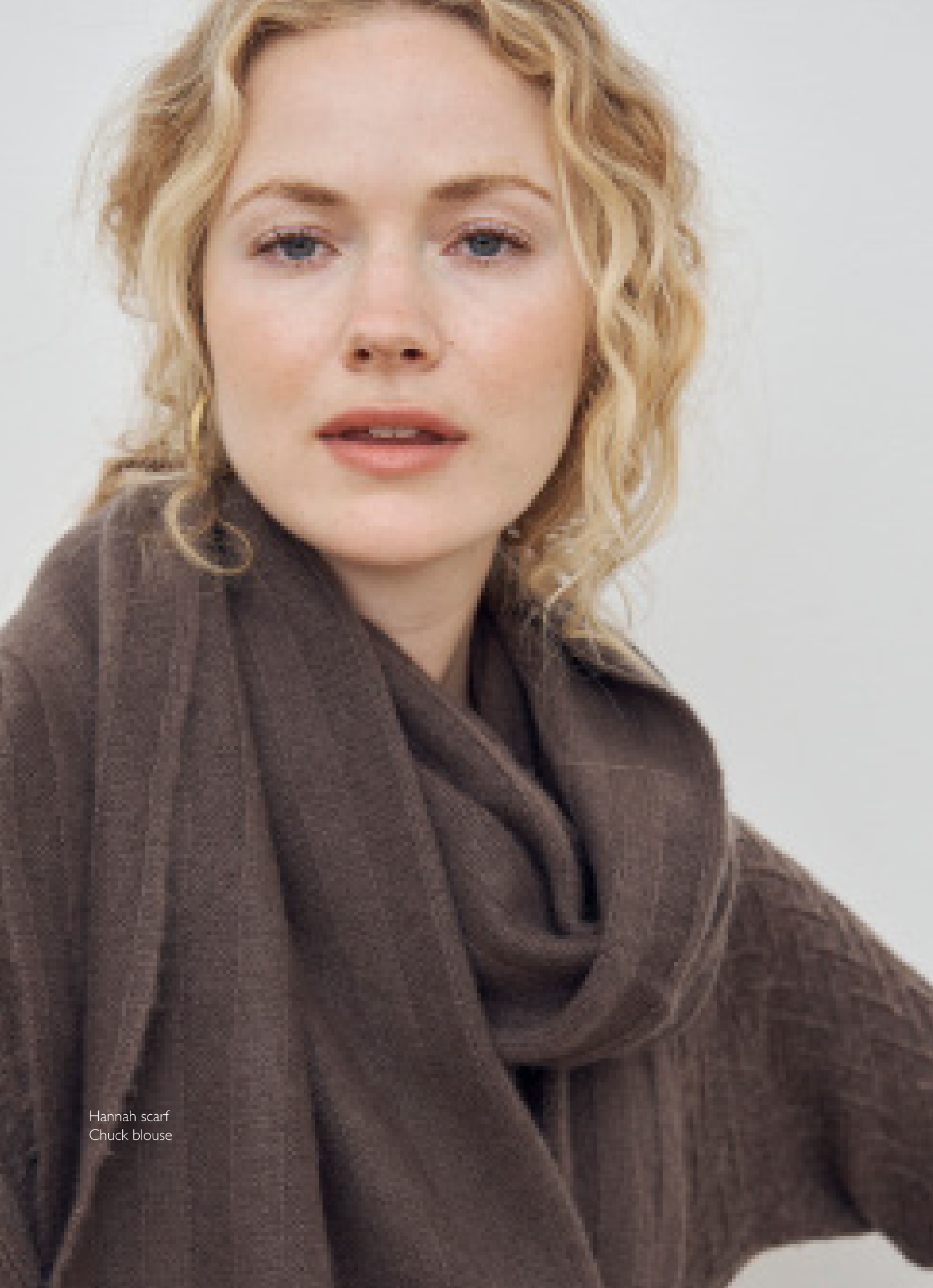
Hannah scarf Chuck blouse