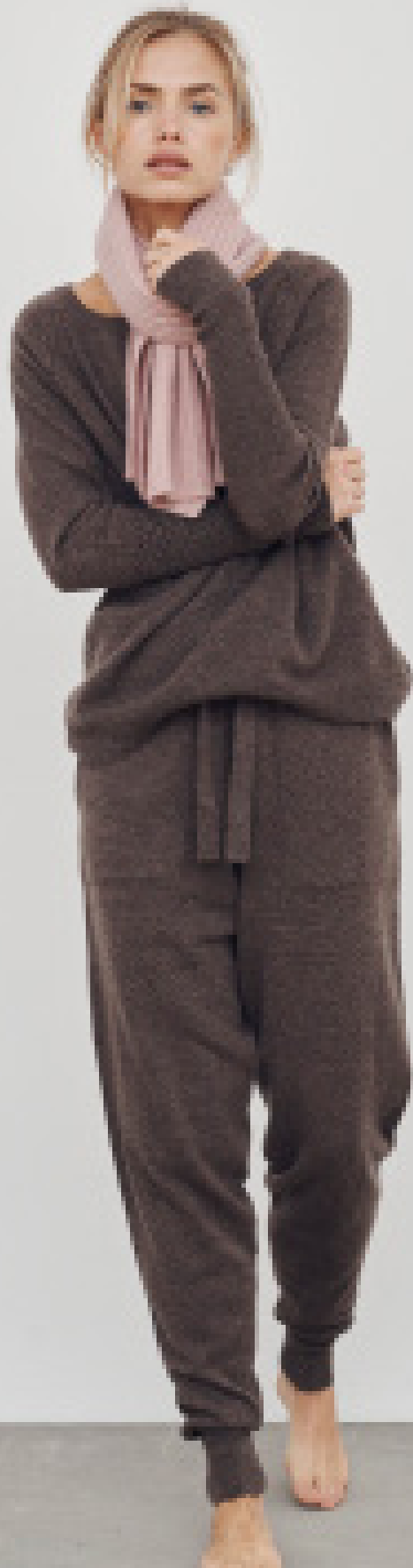
Sara scarf Faith blouse Cornelia pants