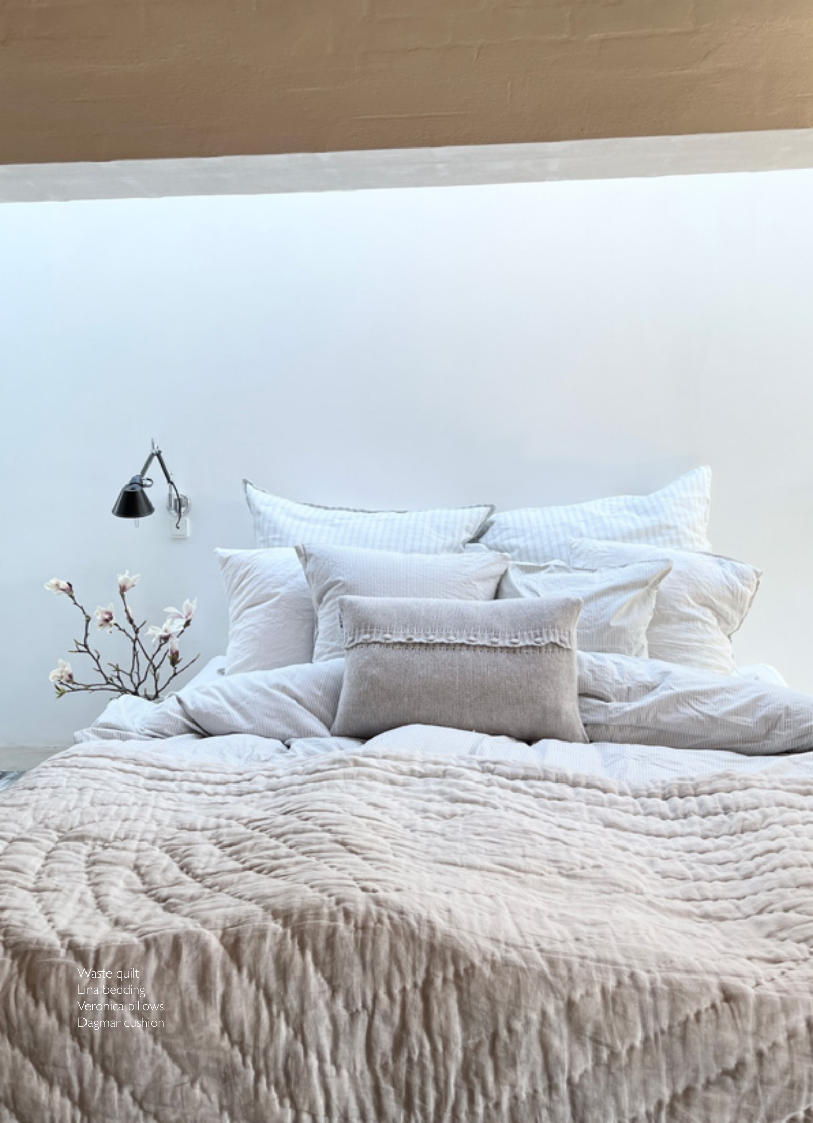
Waste quilt Lina bedding Veronica pillows Dagmar cushion