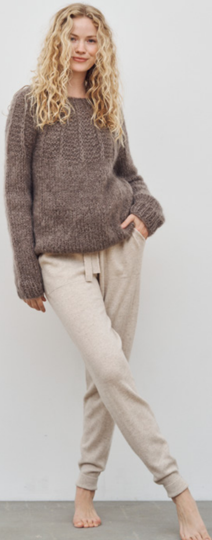
Sunil sweater Cornelia pants