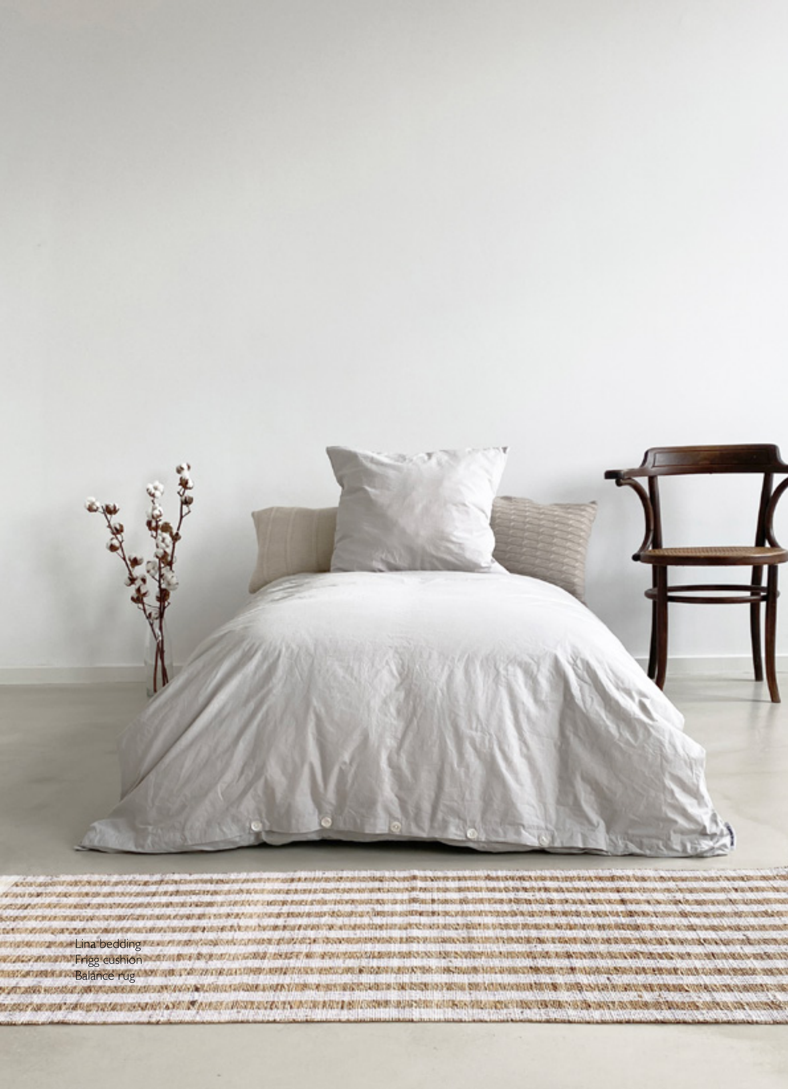
Lina bedding Frigg cushion Balance rug