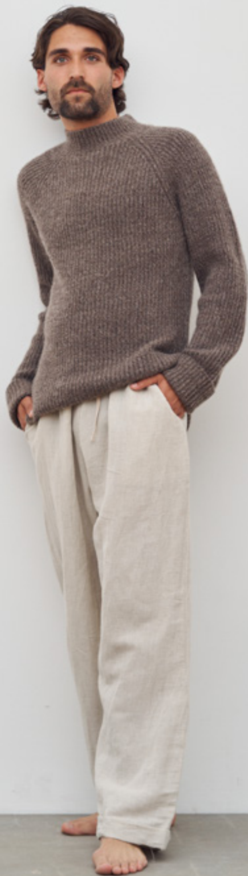
Karl sweater Cecilie pants