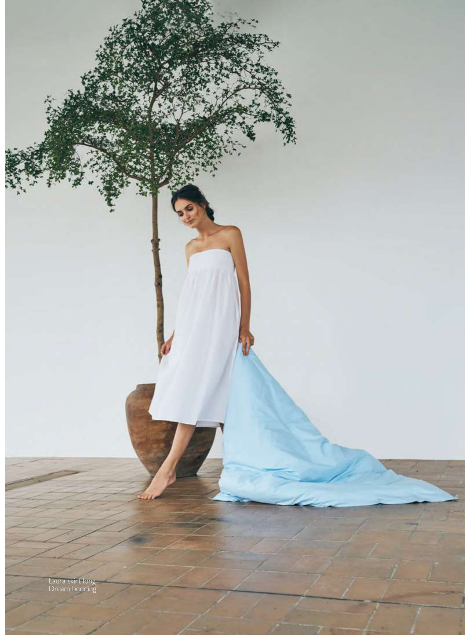
Laura skirt long Dream bedding