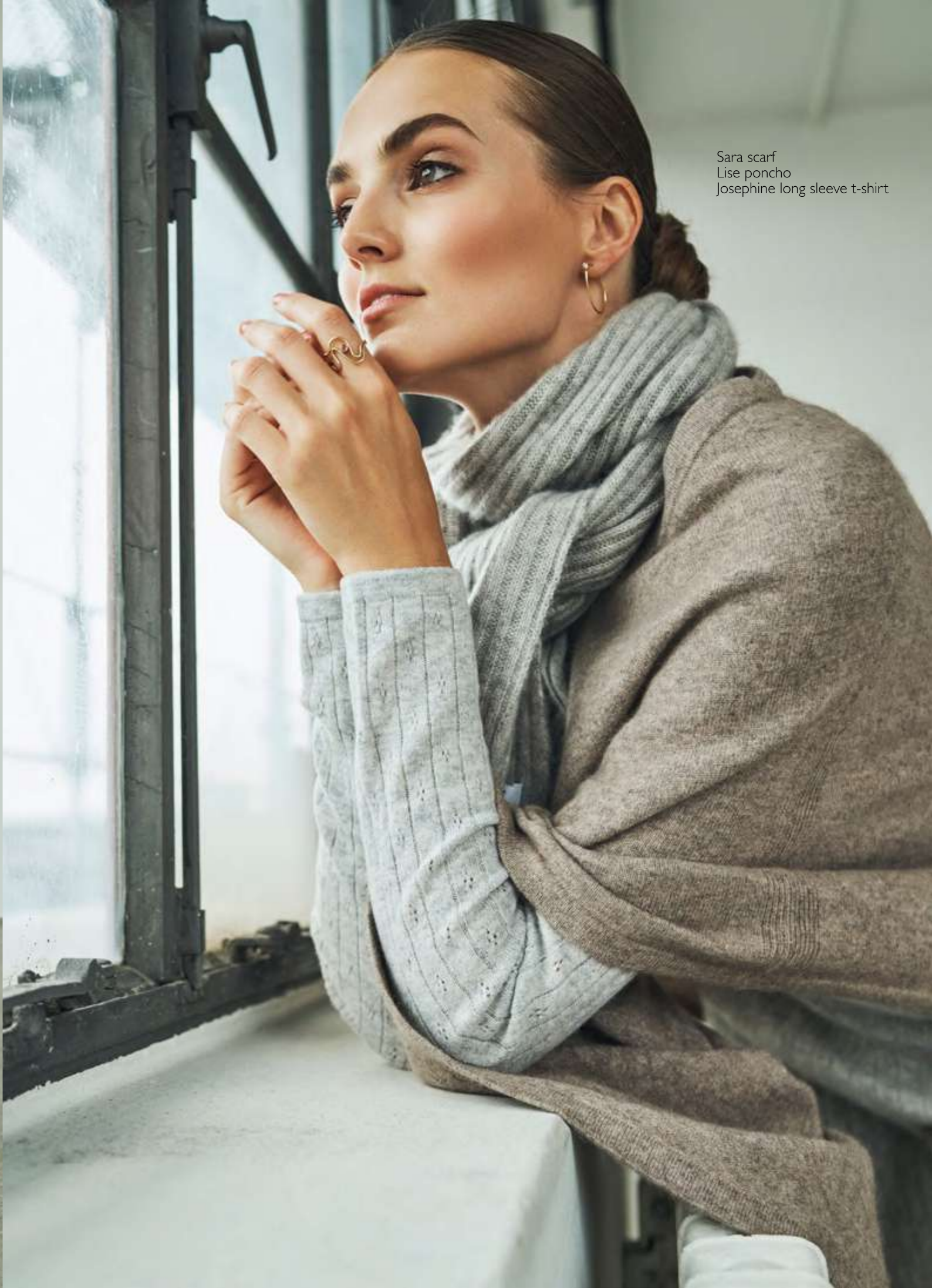
Sara scarf Lise poncho Josephine long sleeve t-shirt