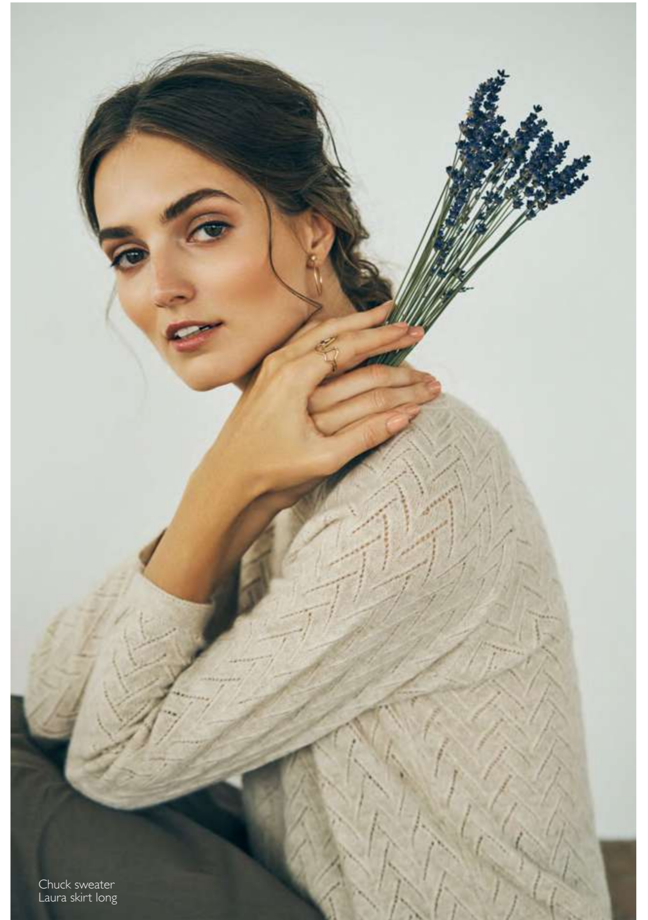
Chuck sweater Laura skirt long