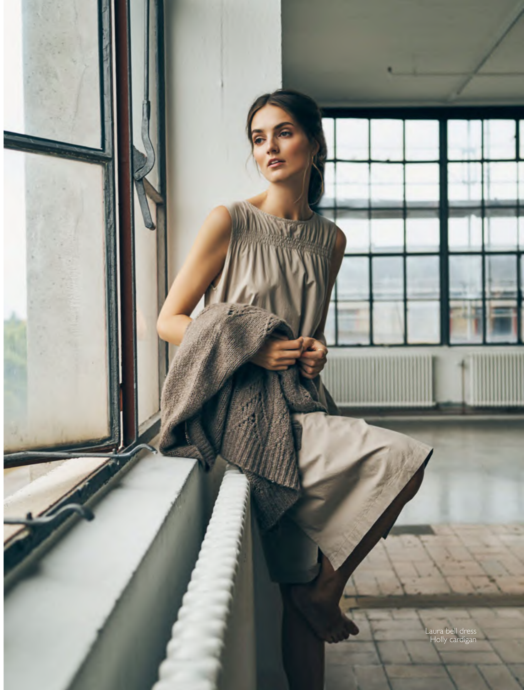
Laura bell dress Holly cardigan