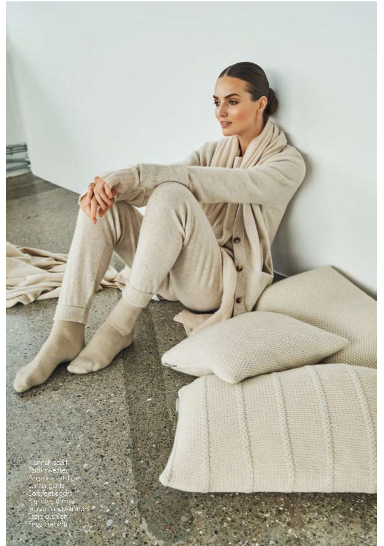
Hannah scarf Faith sweater Angelina cardigan Cinzia pants Soft feet socks Big lotus throw Sussie handwarmers Freja cushion Frigg cushion