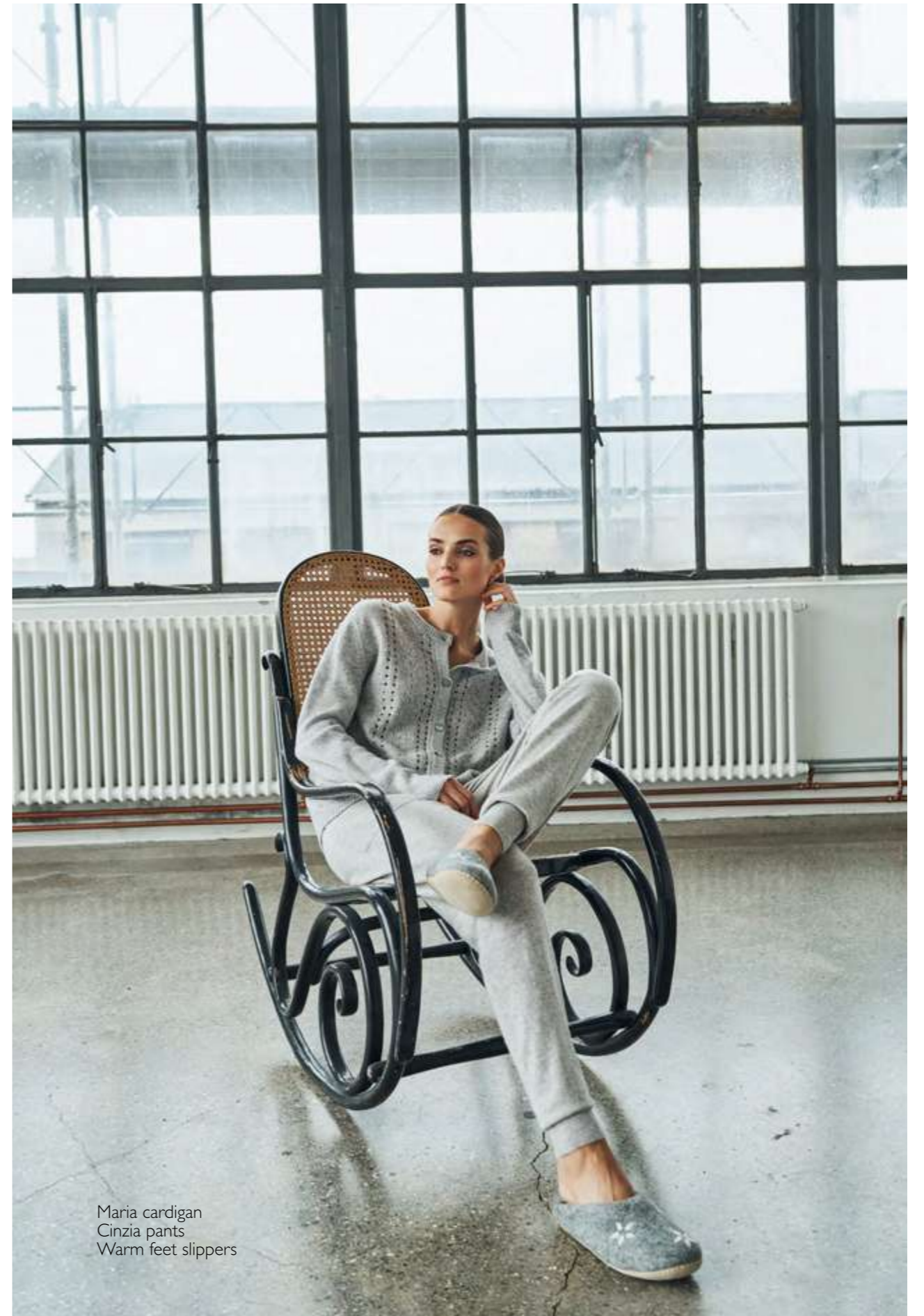
Maria cardigan Cinzia pants Warm feet slippers