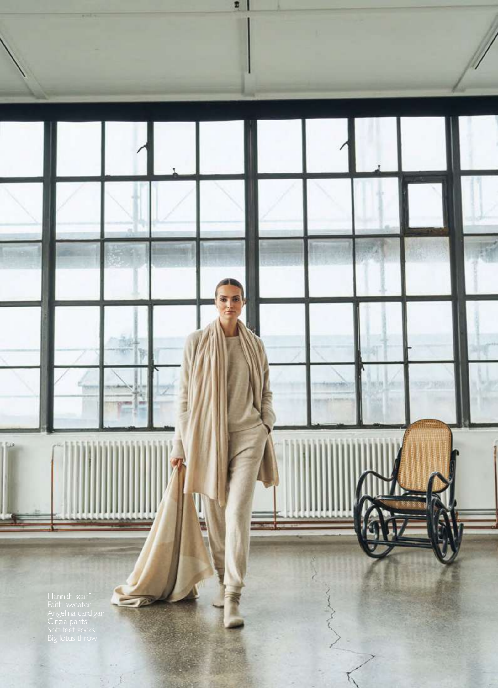
Hannah scarf Faith sweater Angelina cardigan Cinzia pants Soft feet socks Big lotus throw