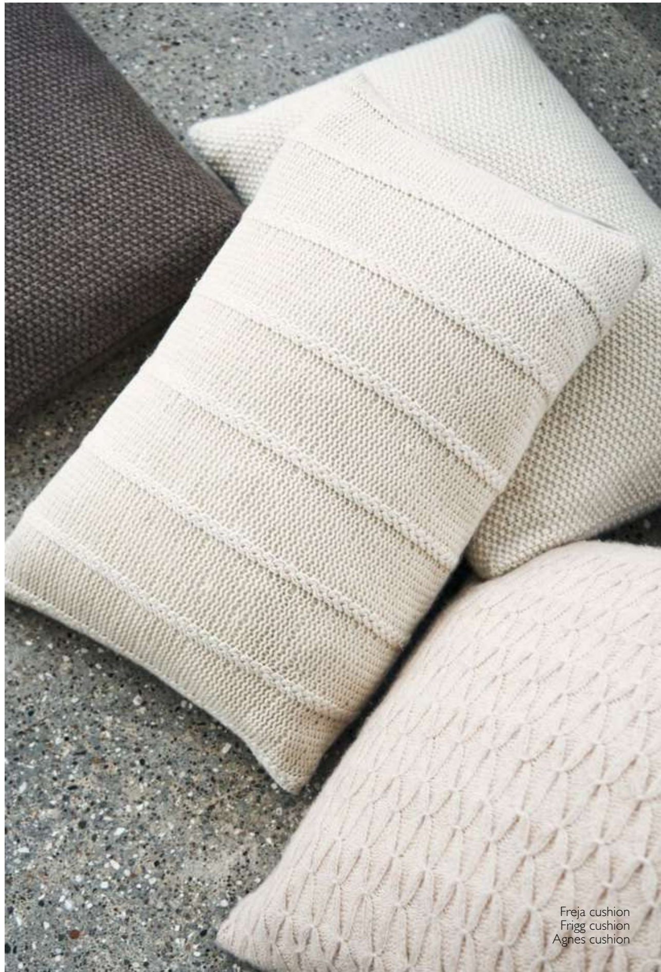
Freja cushion Frigg cushion Agnes cushion