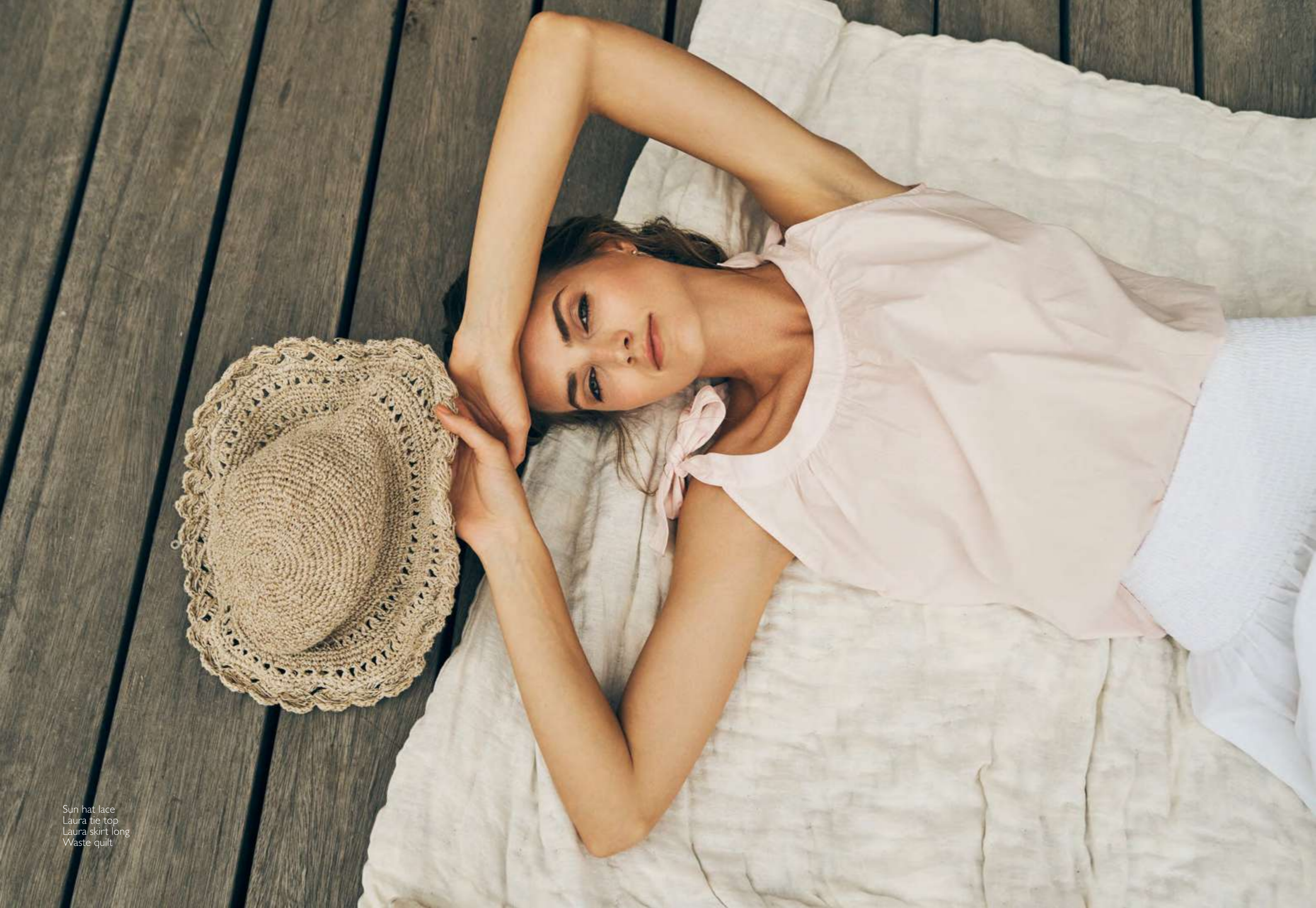
Sun hat lace Laura tie top Laura skirt long Waste quilt