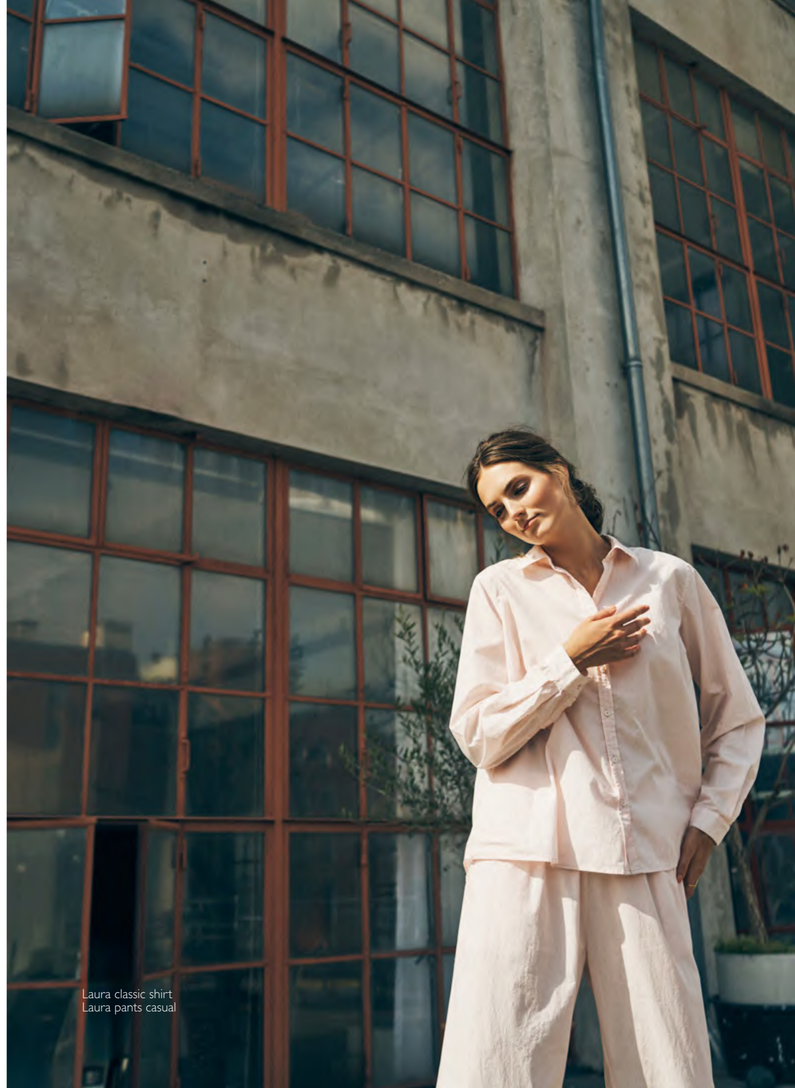
Laura classic shirt Laura pants casual