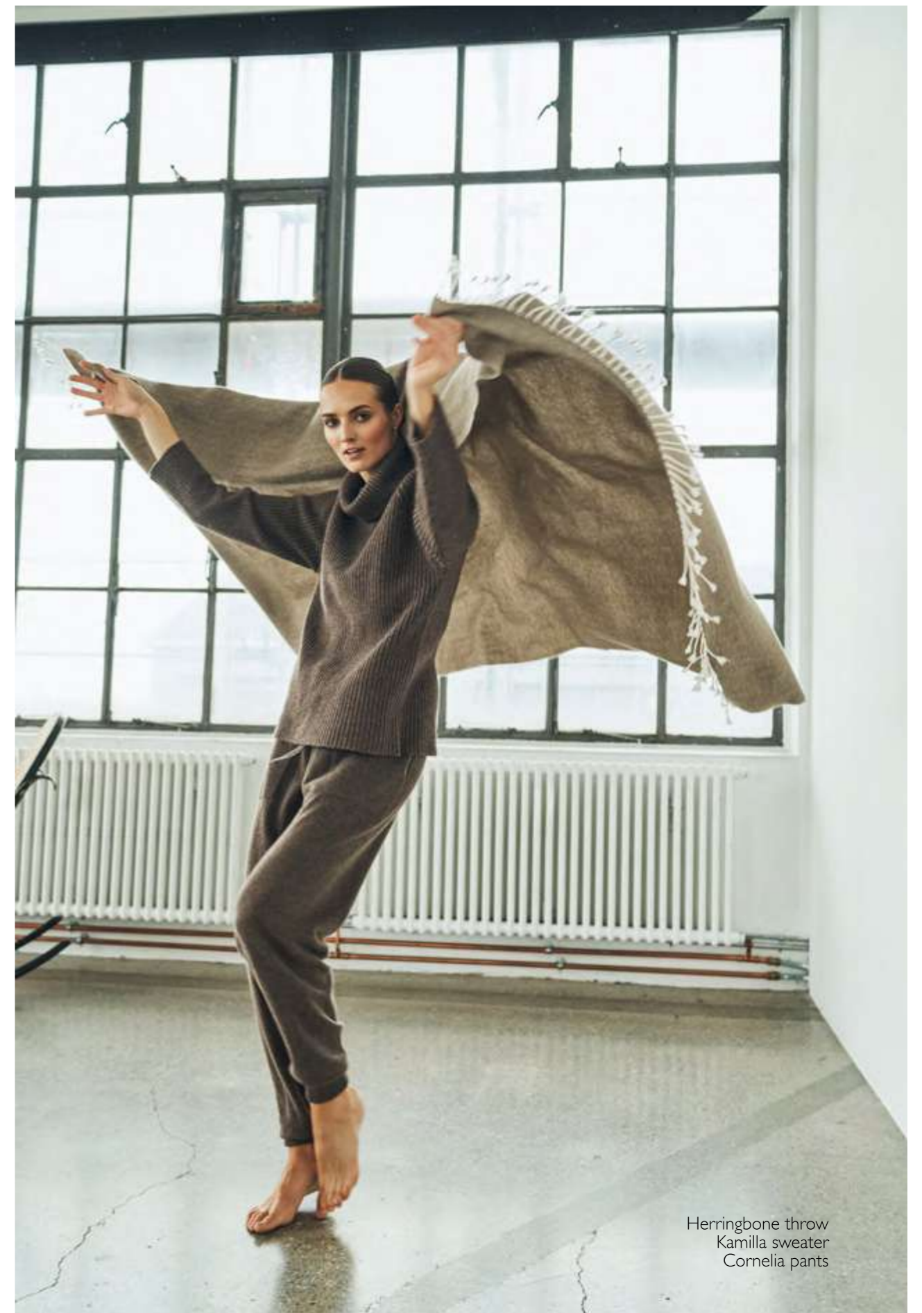
Herringbone throw Kamilla sweater Cornelia pants