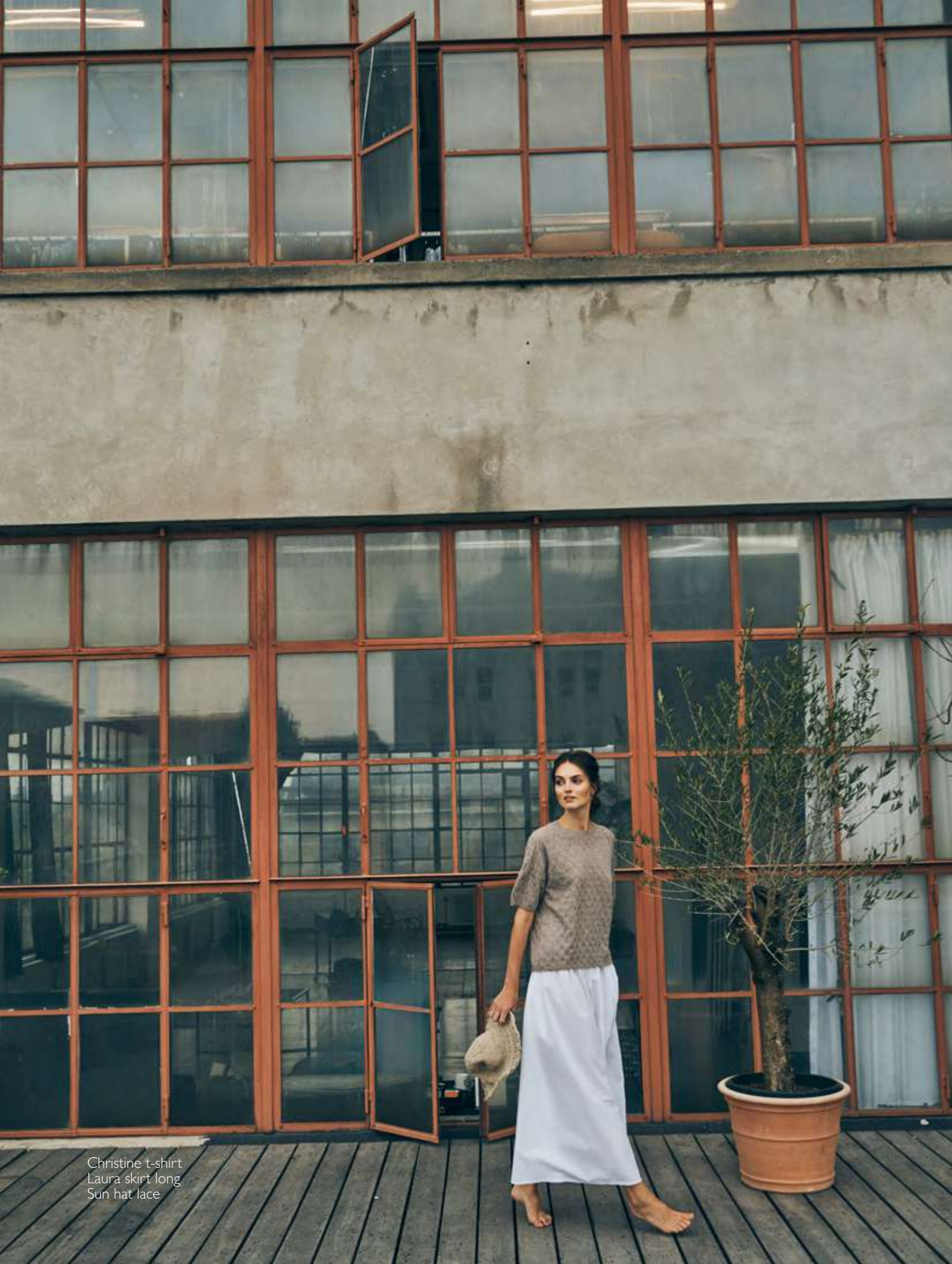
Christine t-shirt Laura skirt long Sun hat lace