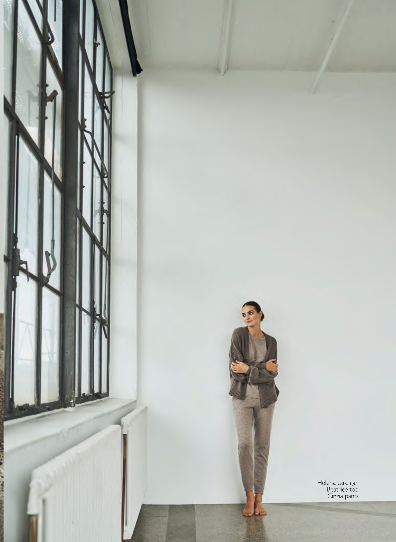
Helena cardigan Beatrice top Cinzia pants