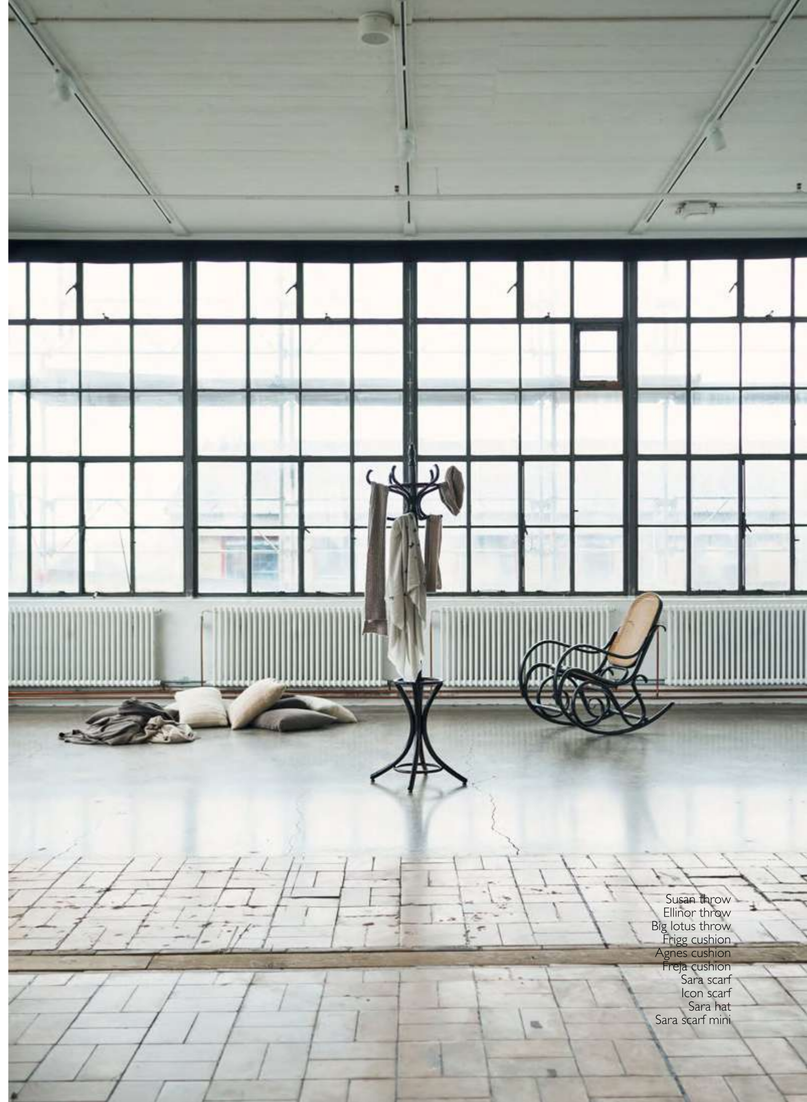
Susan throw Ellinor throw Big lotus throw Frigg cushion Agnes cushion Freja cushion Sara scarf Icon scarf Sara hat Sara scarf mini