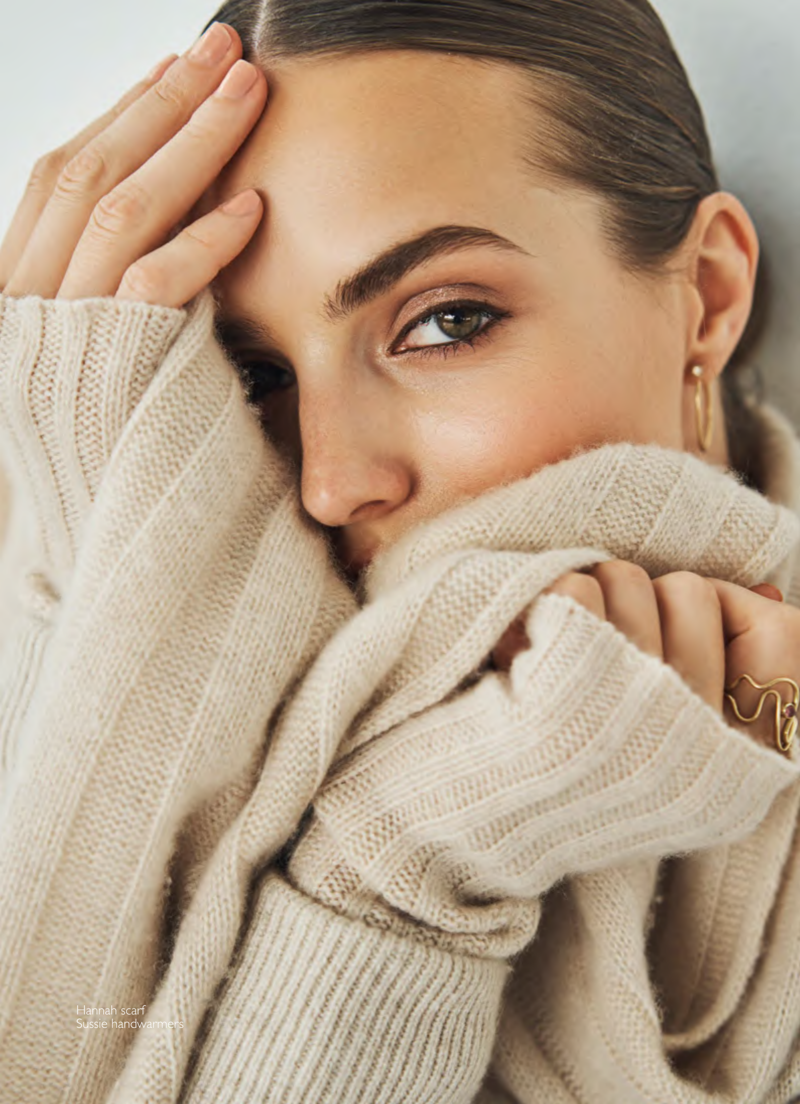
Hannah scarf Sussie handwarmers