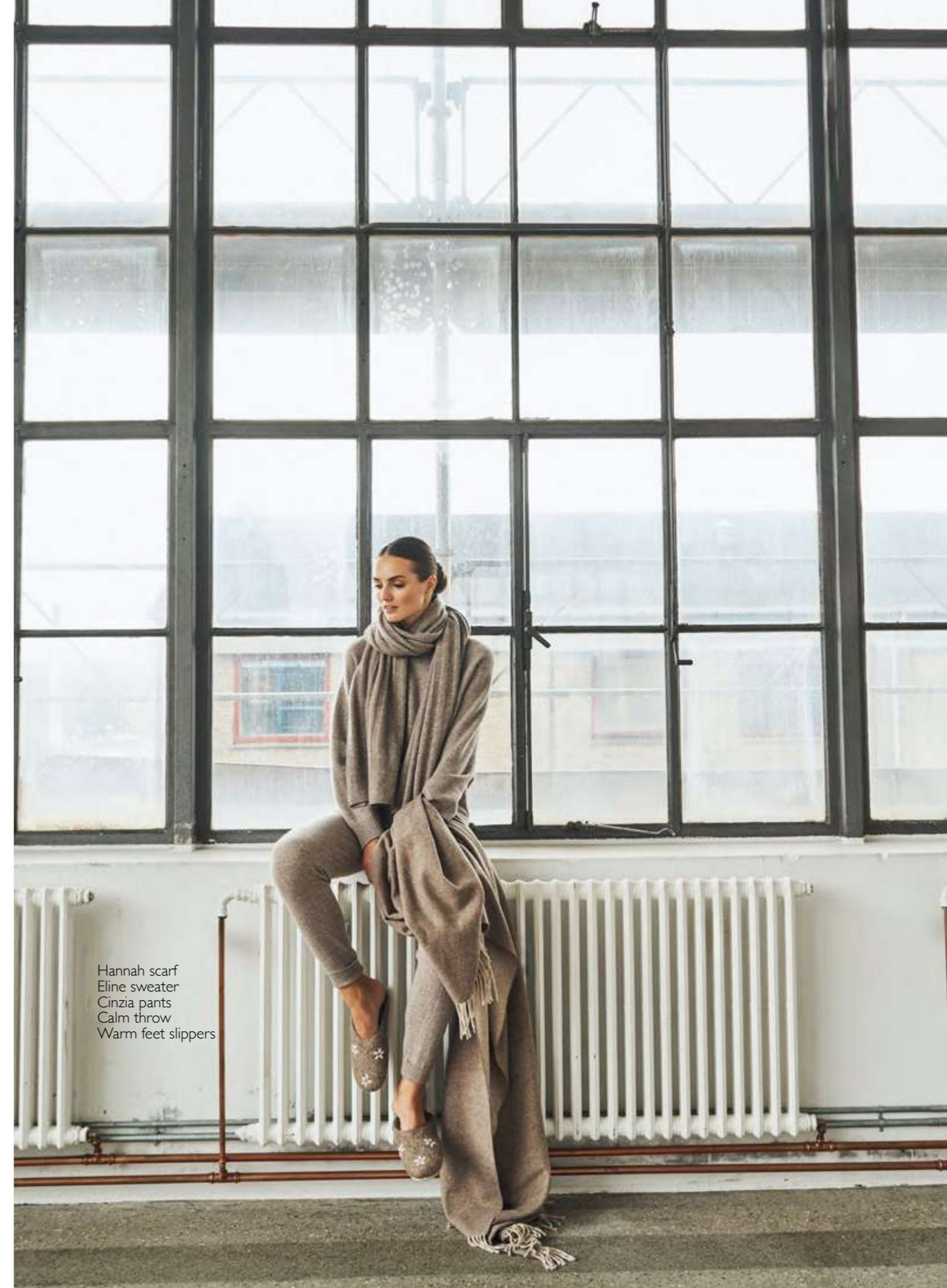
Hannah scarf Eline sweater Cinzia pants Calm throw Warm feet slippers

Join us on a journey towards a more mindful and fulfilling life – one that celebrates the beauty of simplicity and the joy of shared love.