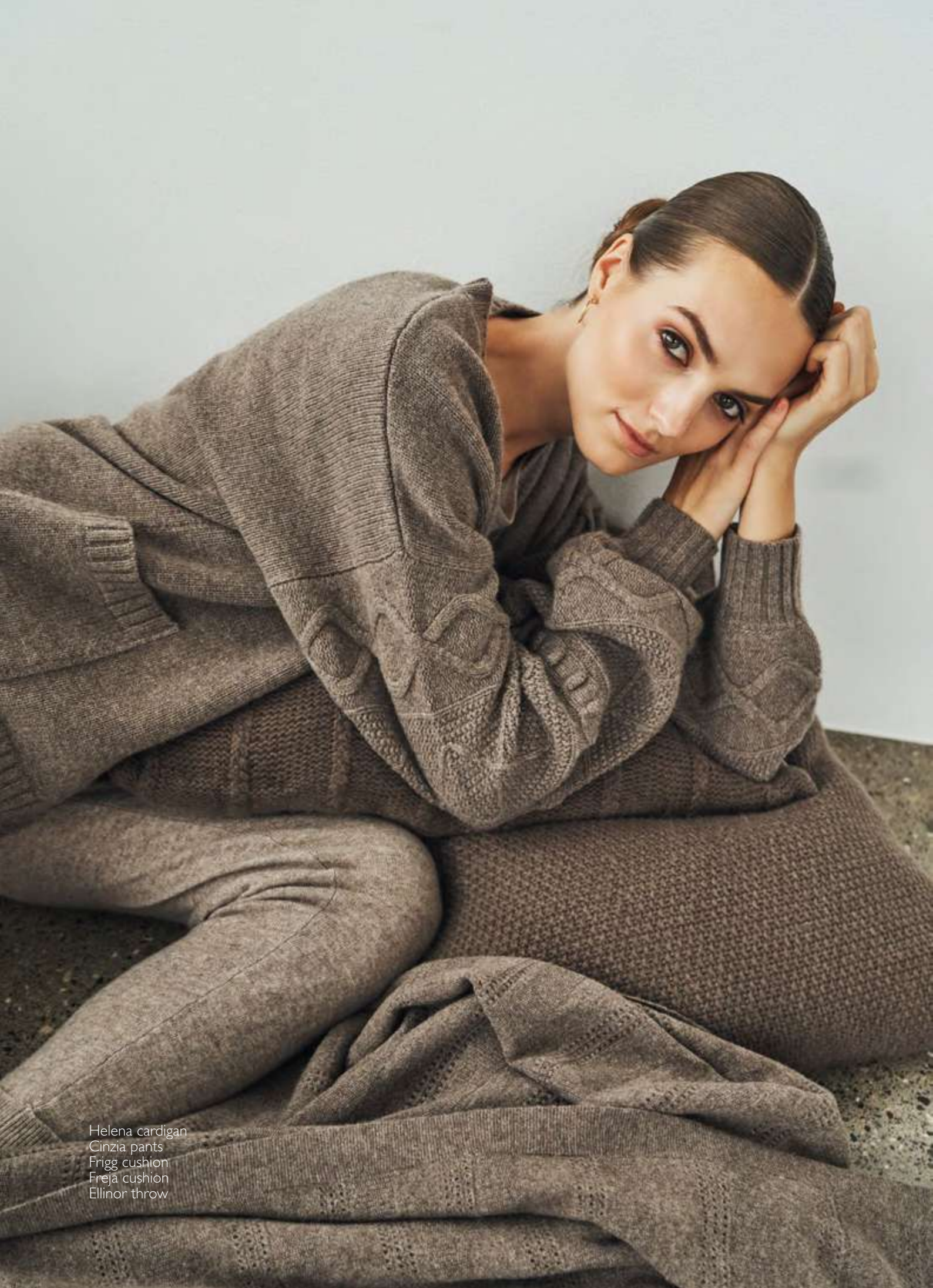
Helena cardigan Cinzia pants Frigg cushion Freja cushion Ellinor throw