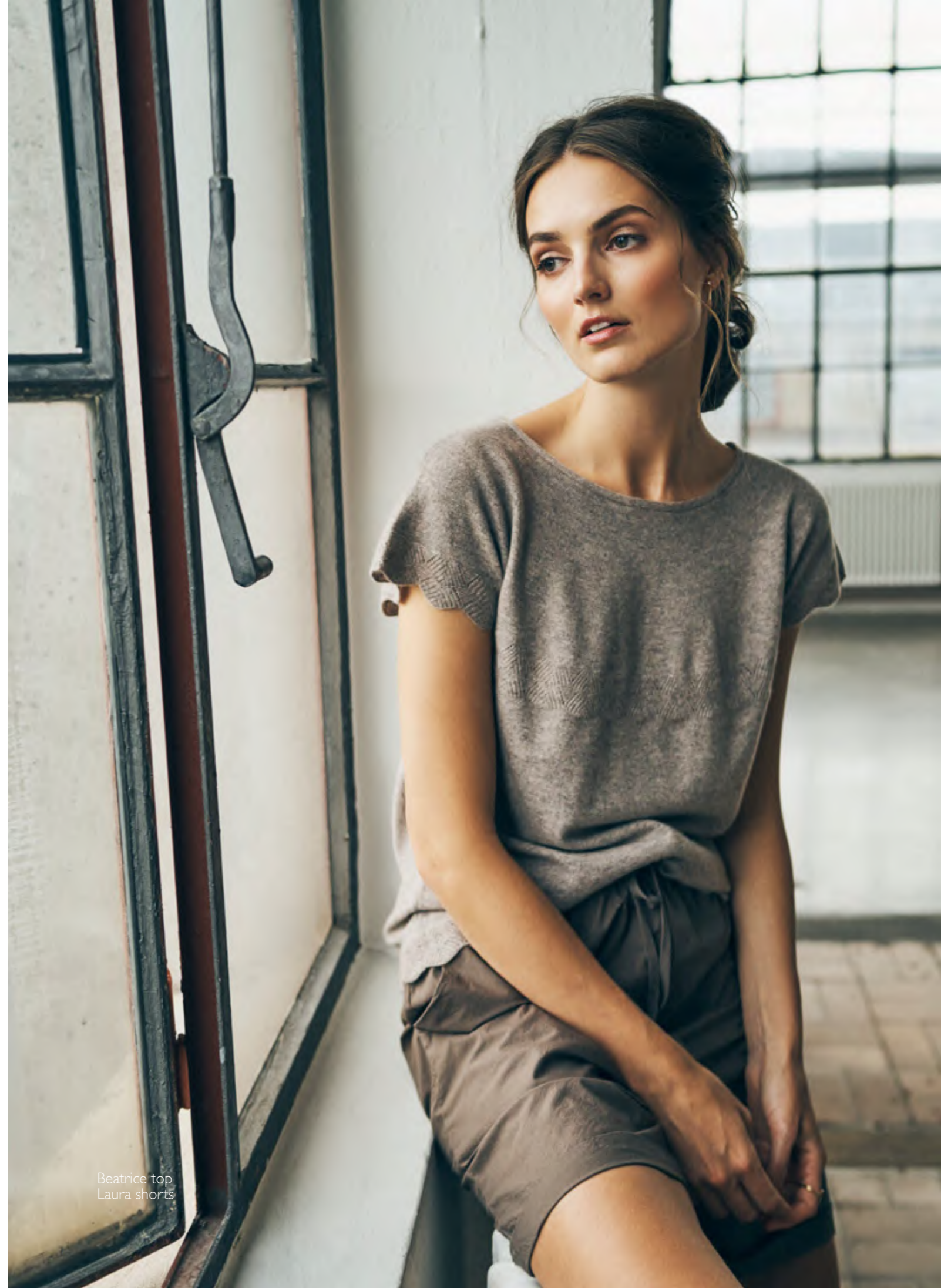
Beatrice top Laura shorts