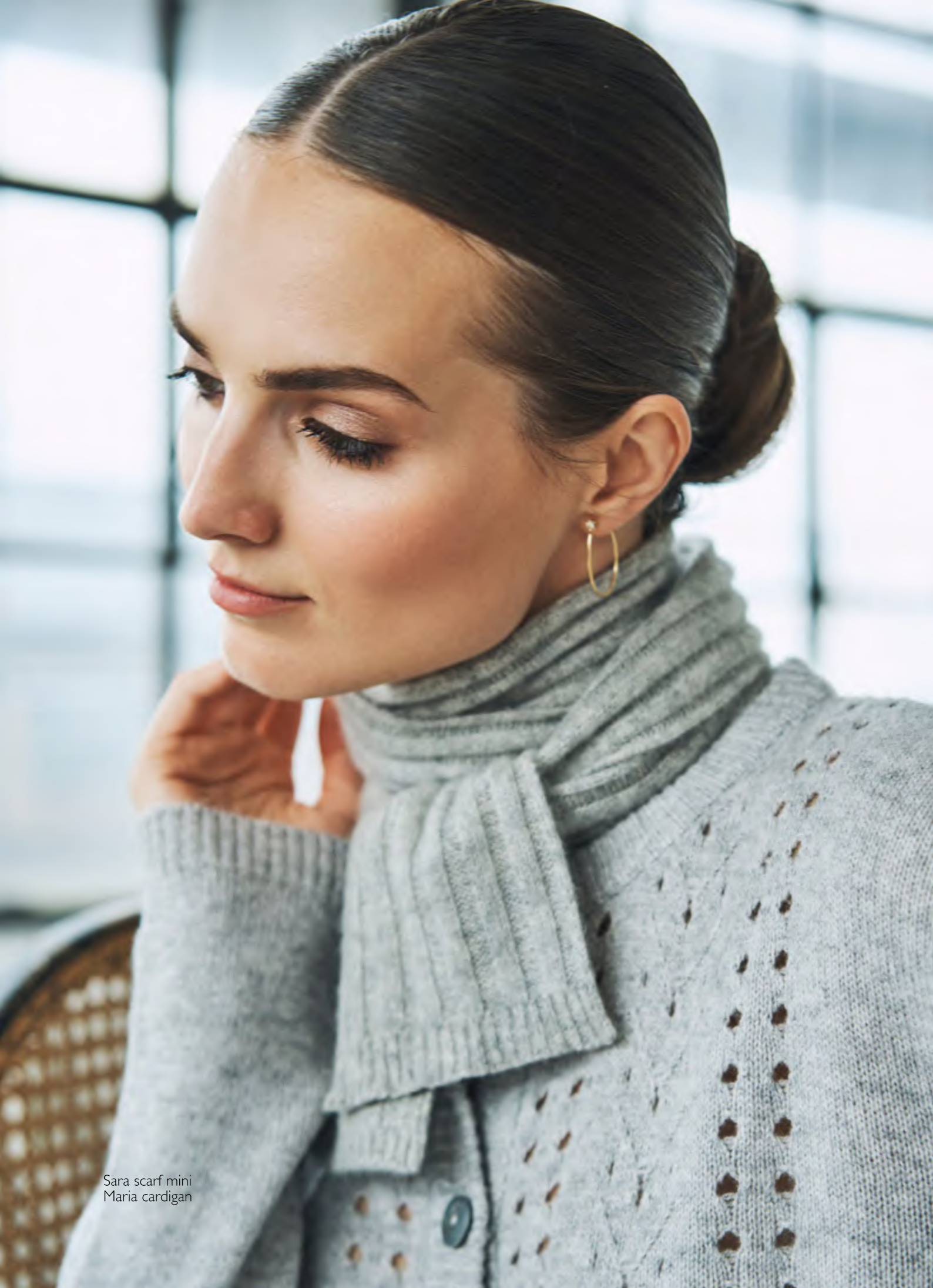
Sara scarf mini Maria cardigan