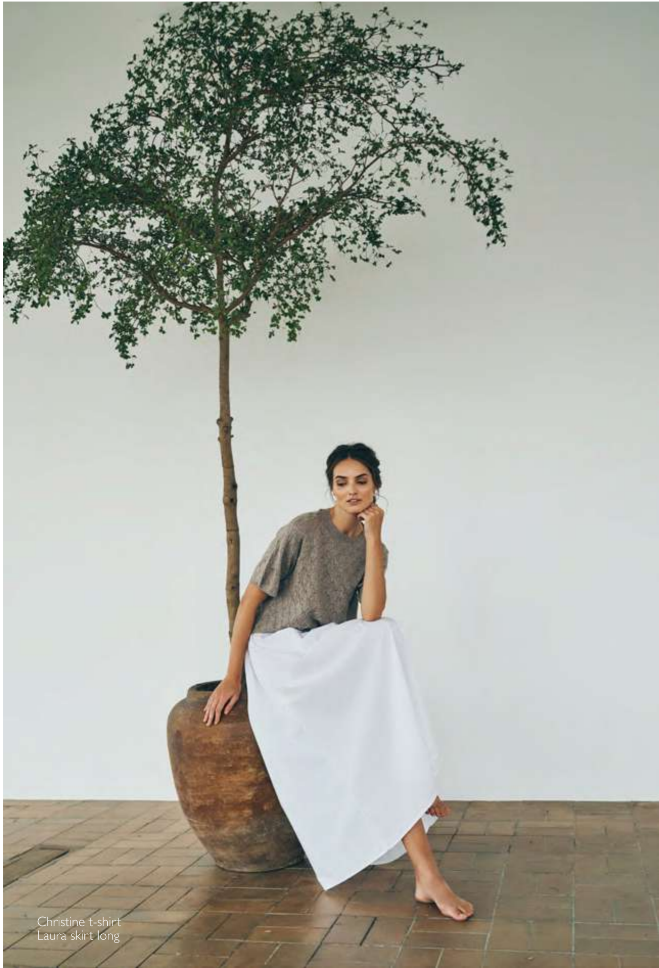
Christine t-shirt Laura skirt long