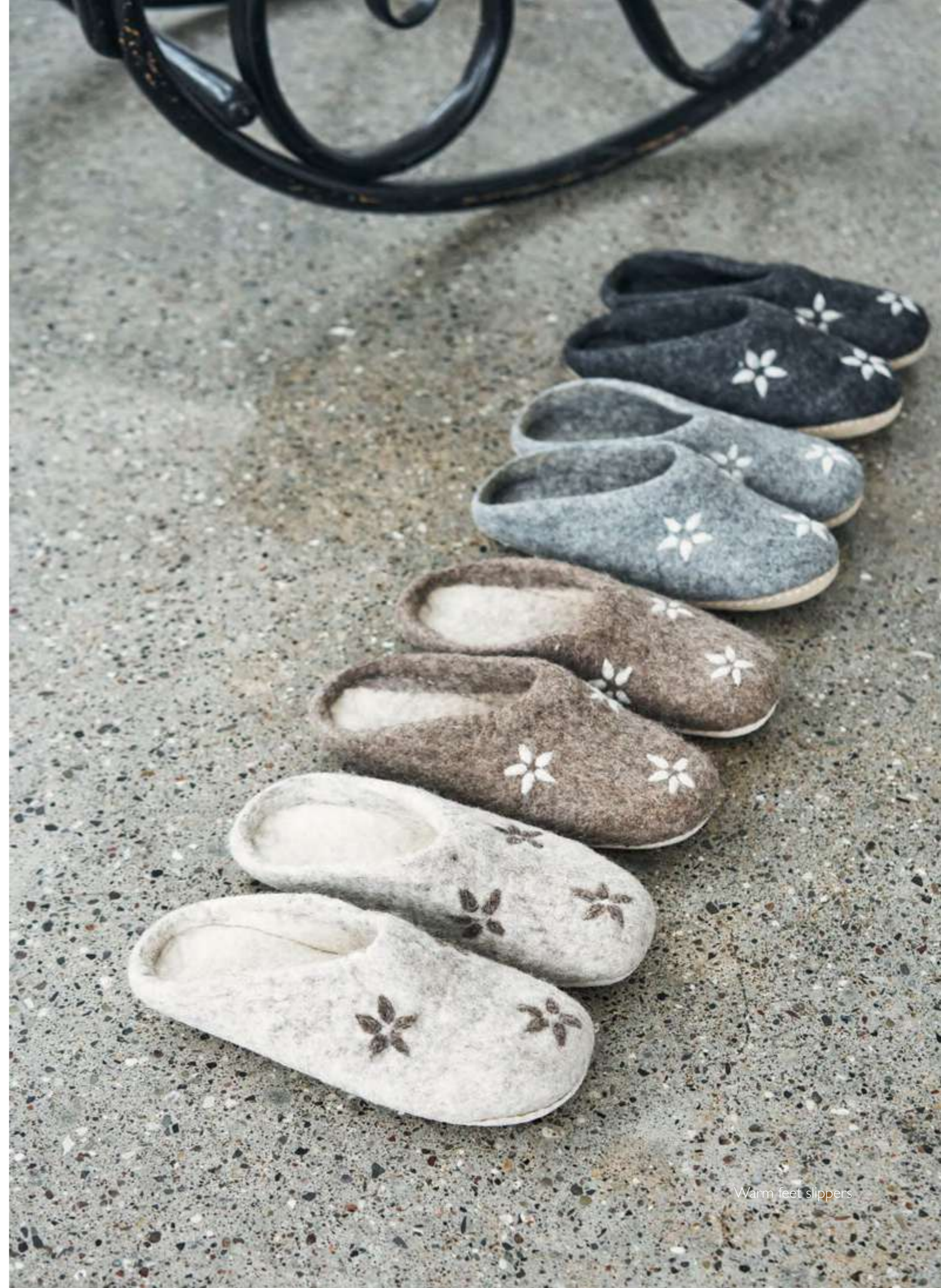
Warm feet slippers