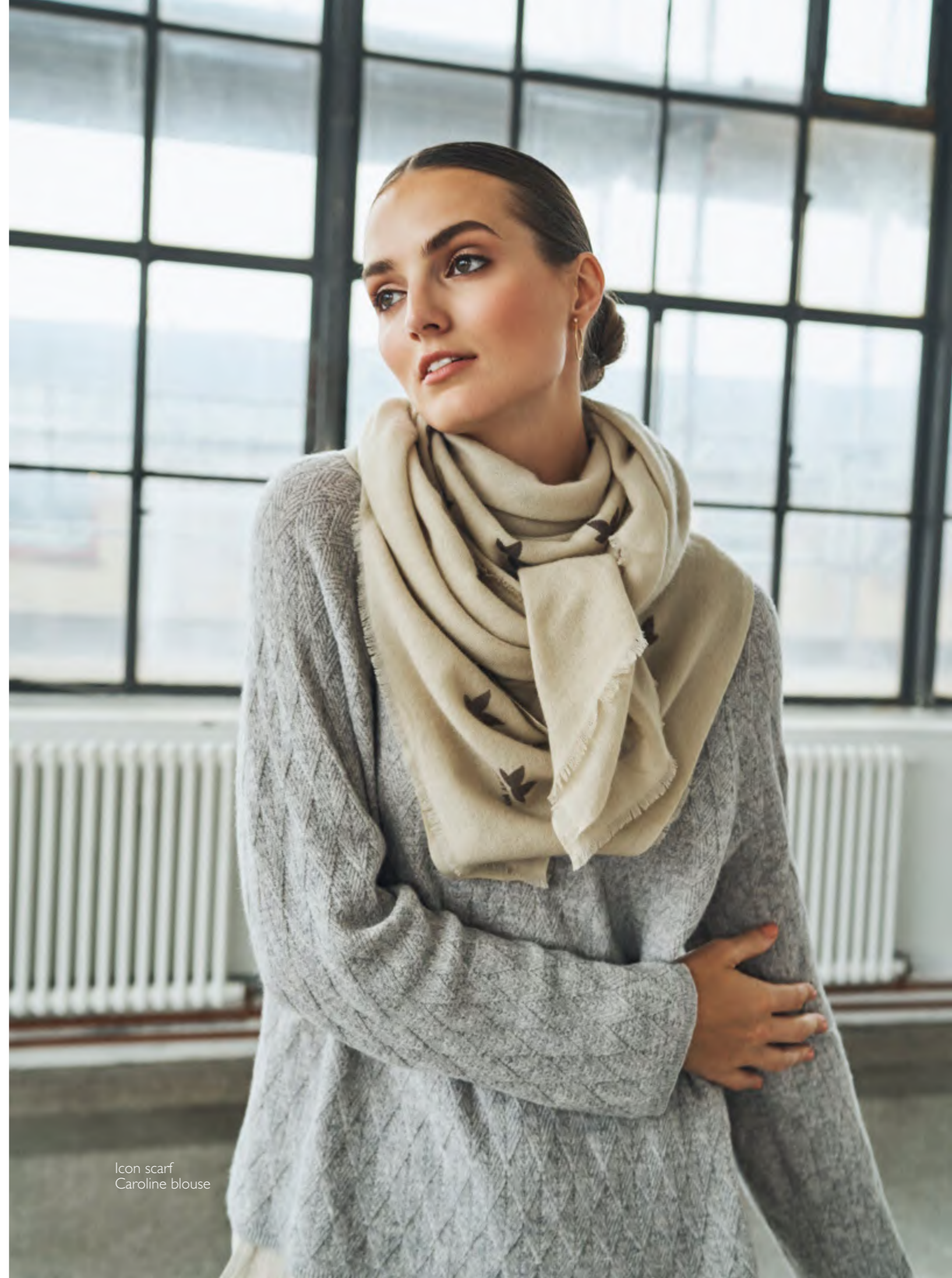
Icon scarf Caroline blouse