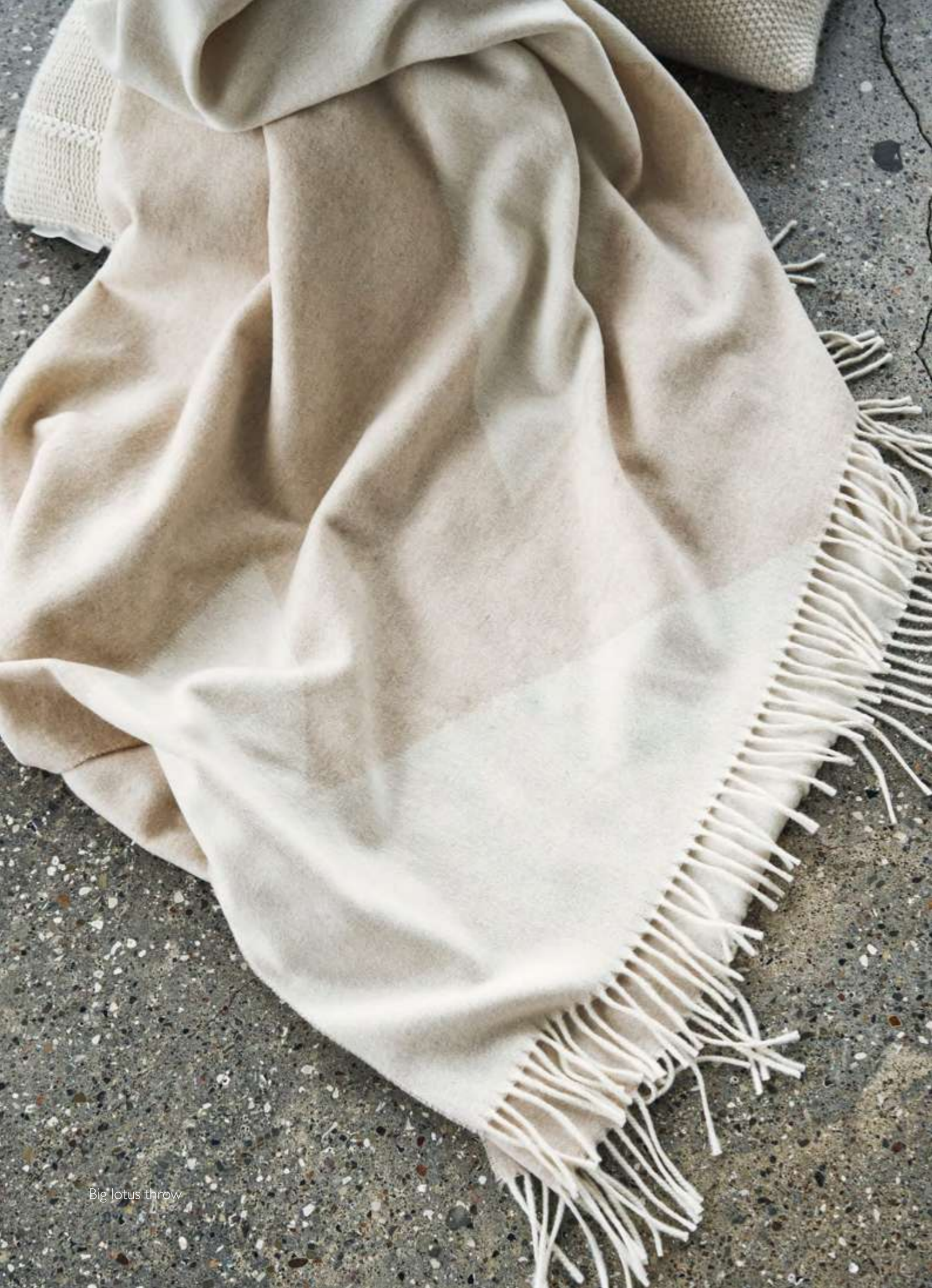
Big lotus throw