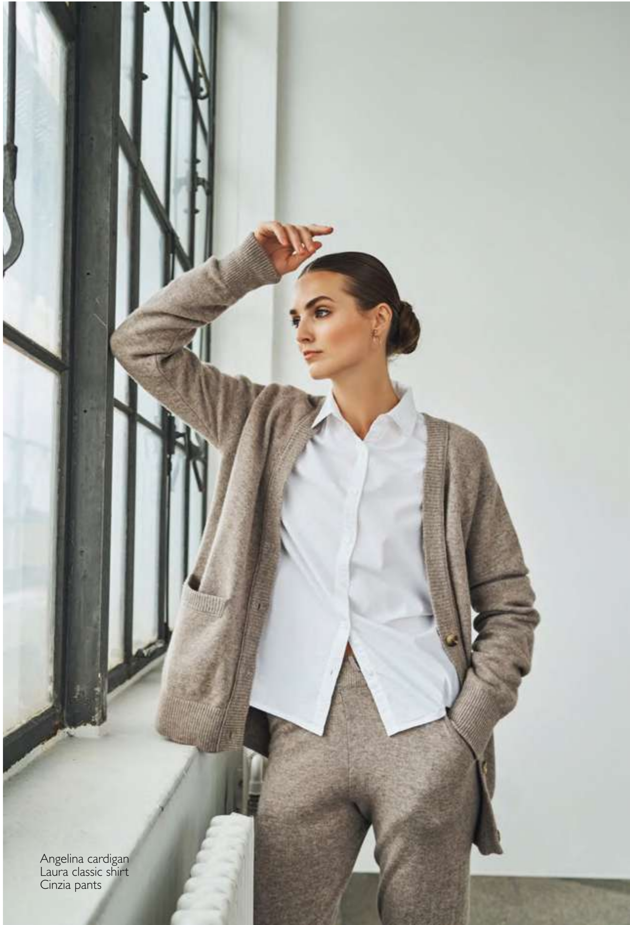
Angelina cardigan Laura classic shirt Cinzia pants