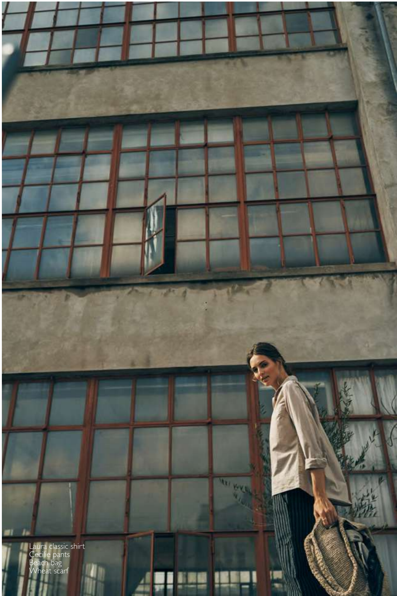
Laura classic shirt Cecilie pants Beach bag Wheat scarf