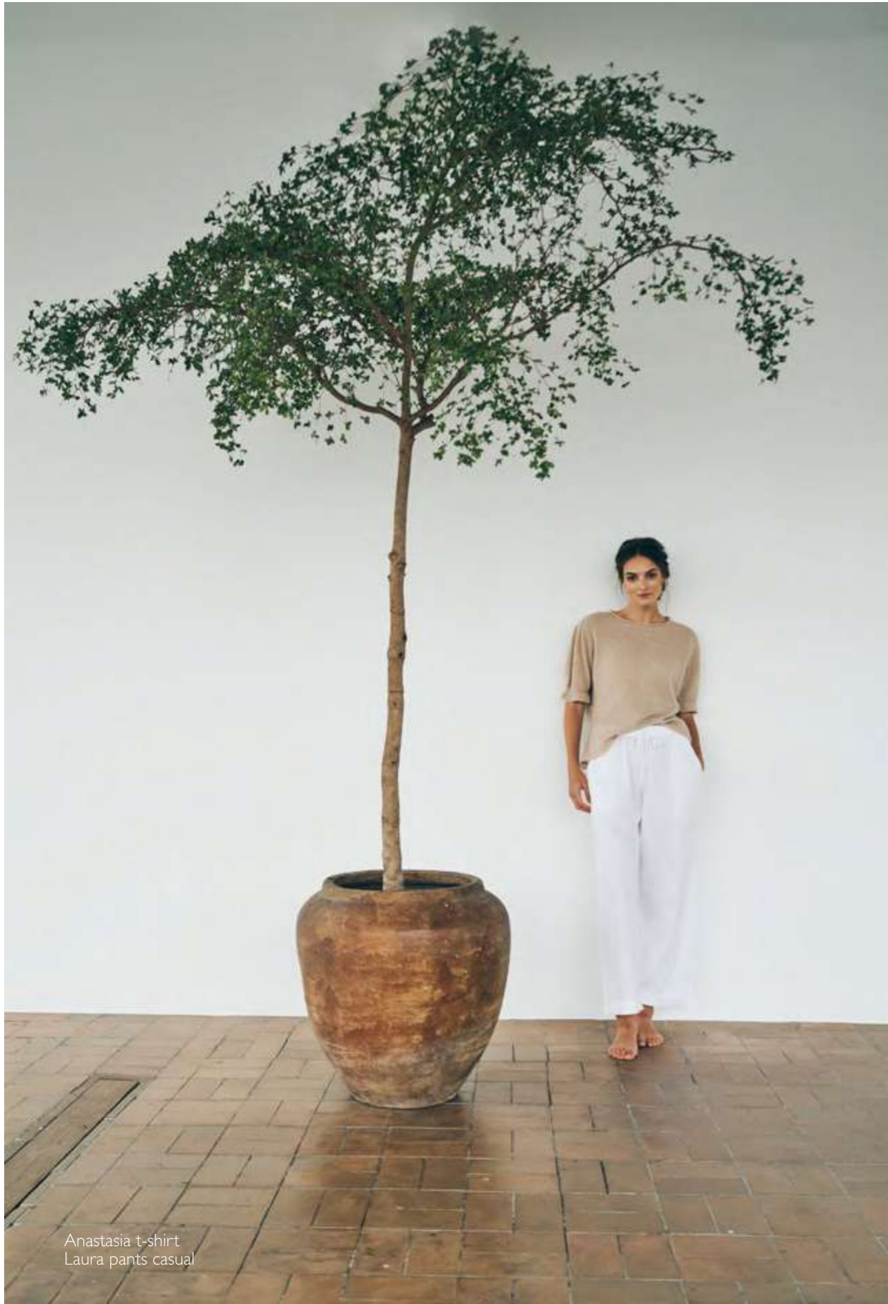
Anastasia t-shirt Laura pants casual