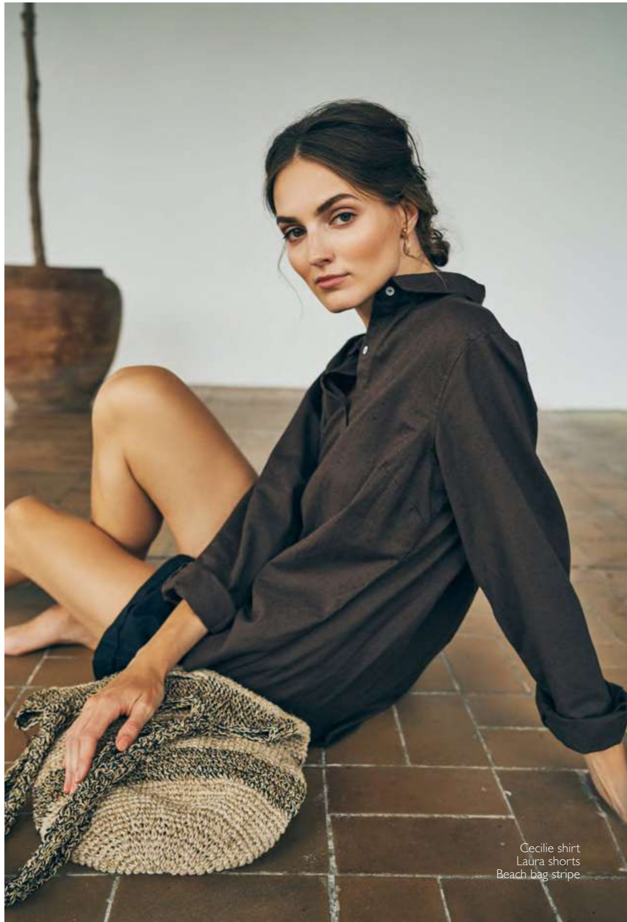
Cecilie shirt Laura shorts Beach bag stripe