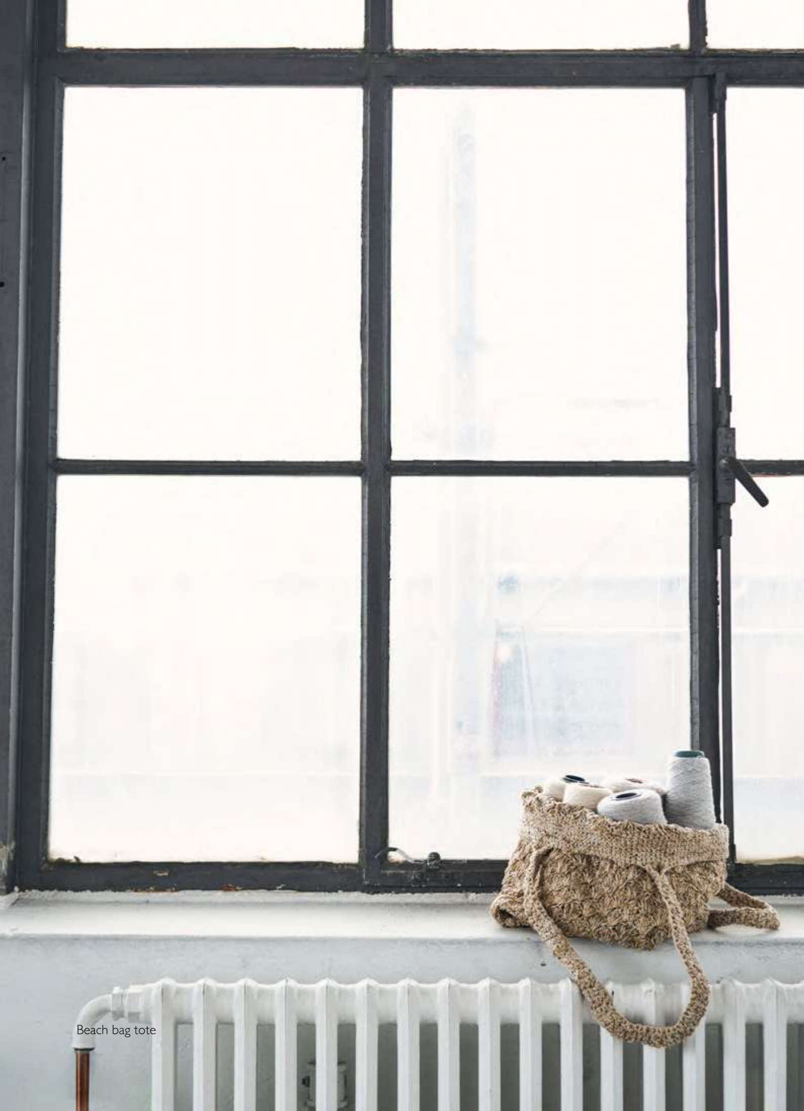
Beach bag tote