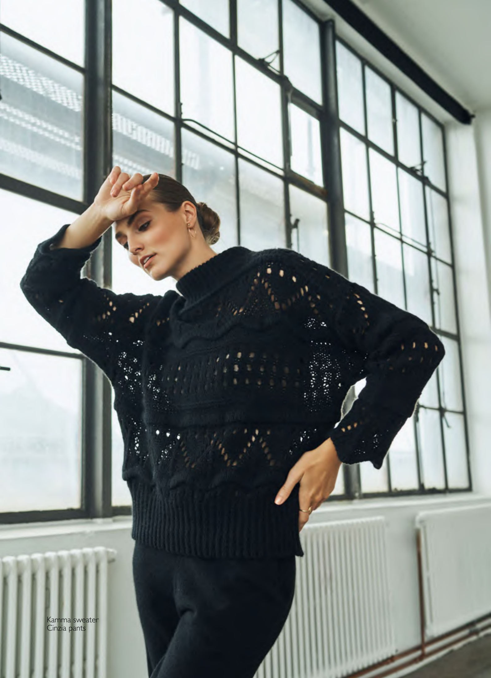
Kamma sweater Cinzia pants