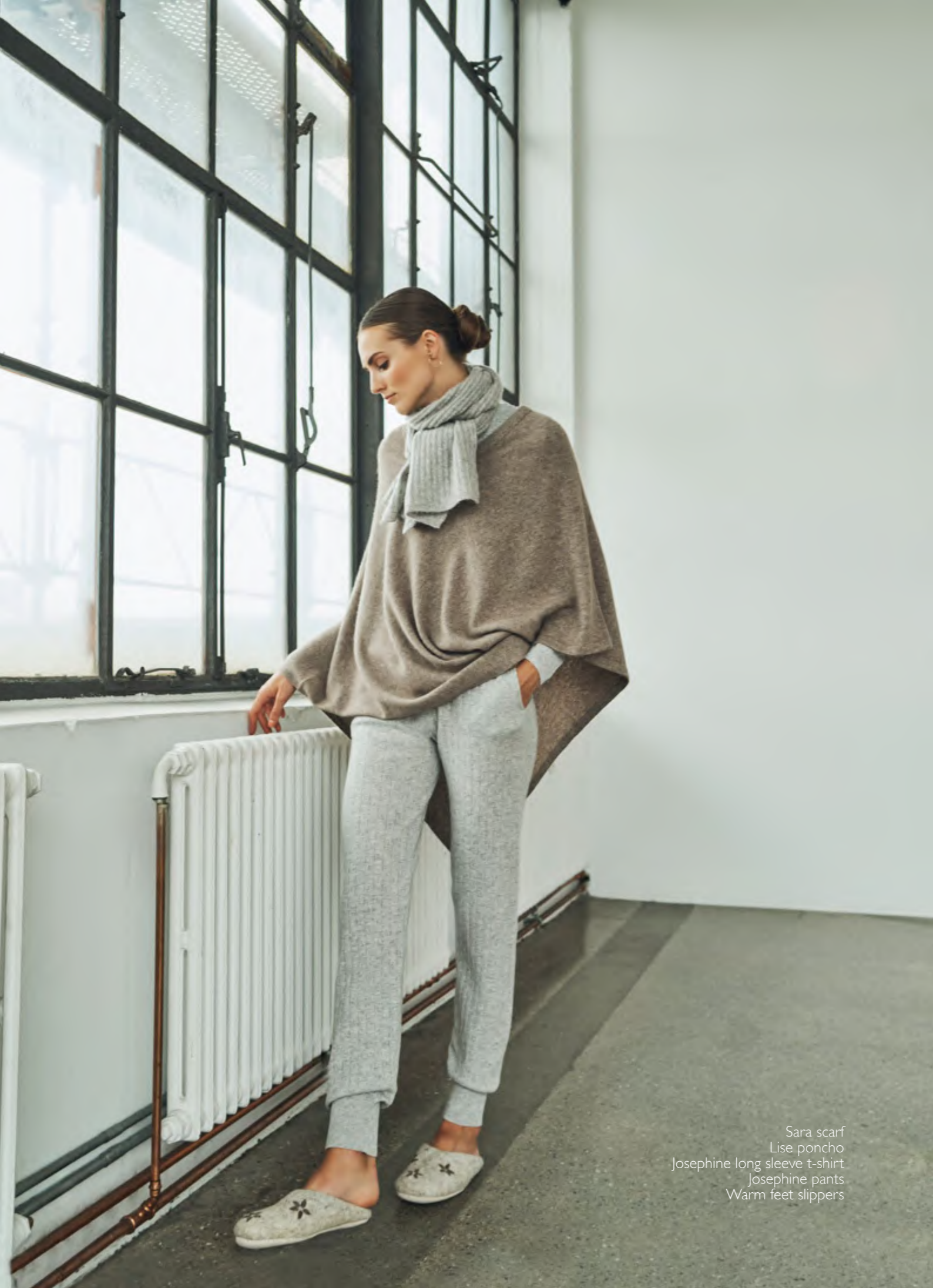
Sara scarf Lise poncho Josephine long sleeve t-shirt Josephine pants Warm feet slippers